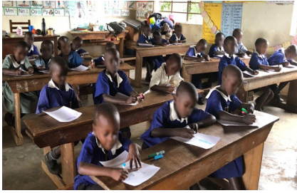
Figure 4. Students in Uganda Drawing Their Postcards.

their body on the wall with chalk and then write or draw the things that they need and that they want and discuss them.