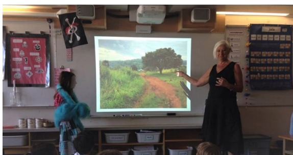
Figure 6. The Facilitator/Researcher and a Young Student Helper Sharing Information about the School and Community in Uganda with Students in Canada.

Then the children were given time to develop their letters. They had several days to complete these, as shown in Figure 7. The session then closed with another circle where the children cooperated to move the hula hoop around the circle without breaking the link.