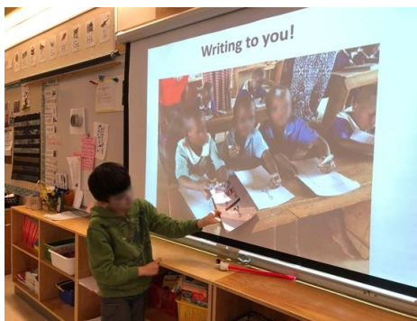
Figure 7. Children in Canada Showing Postcards Received from Students in Uganda and Looking at Pictures of Children Writing Postcards in Uganda.