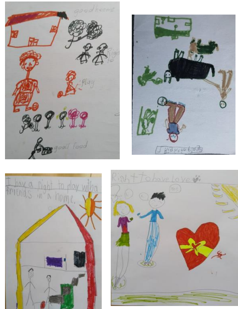
Figure 5. A Selection of Four Pictures Created by Students (from Left to Right) in Uganda, Canada, Uganda, Canada.

An additional session focused specifically on the connections between the Canadian and Ugandan students. It aimed at increasing the students' understanding about child rights, creating connections between different communities, and providing space to discuss the similarities and differences in their understandings of child rights. This session allowed the children to express their ideas to a new friend of a similar age, strengthen relationships with educators in both countries, and synthesize key points to analyze for a research paper and presentation.