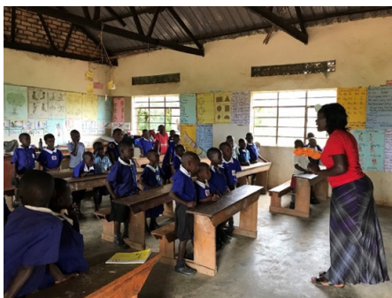
Figure 1. The Facilitator/Teacher Introducing Nunu the Puppet in Uganda.