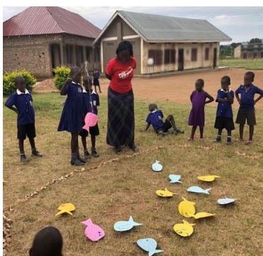
Figure 2. Illustration of Children in Uganda Playing Fishing for Rights.

divided into three groups, each of which engaged in an activity for about 20 minutes before rotating so all activities were undertaken by all students.