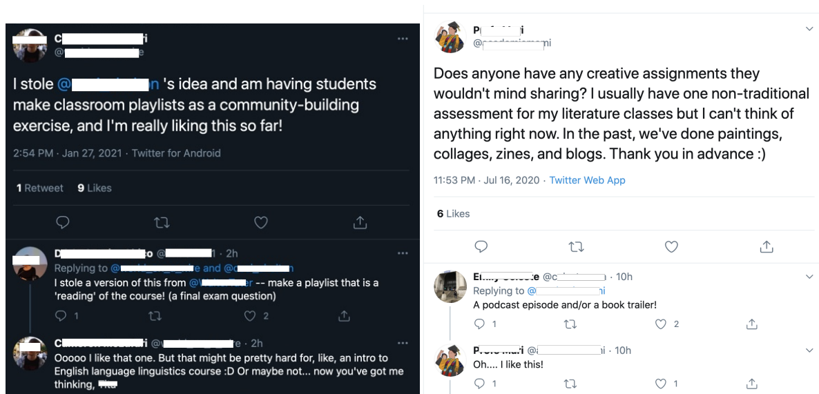
Figure 1. Social media posts of fetishized assignments

Media are epistemological and ontological, bound up in the construction of our knowledge and selves. Meaning-making occurs through and within technical tools as technical objects, tools that are not neutral but rather authorial participants in meaning-making. Composing tools can be said to be co-authors due to the ways they shape the human writer's experience of reality and influence thinking. Consider, for instance, what happens when different composing tools are used in order to tackle a writing task from a different perspective. Think of times when you've printed a draft to highlight, draw on, and cut up, or left the linearity of the word processor for other digital applications like Scrivener or OneNote that allow authors to tag and rearrange content. These tool changes lead to changes of experience and perspective that modify authorial thinking and, therefore, shape content. The fetishization of digital tools as simple and neutral obscures their co-authorship roles and limits acknowledgement of the extent to which writing is "more-than-human" (Wargo, 2018, p. 4). A more-than-human perspective insists that "technology, environs, and human beings can no longer be conveniently or neatly distinguished" (Brooke & Rickert, 2011, p. 169).