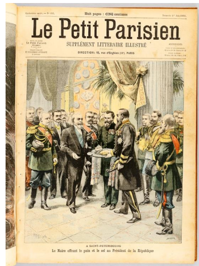
10. “Le Maire offrant le pain et le sel au Président de la République”