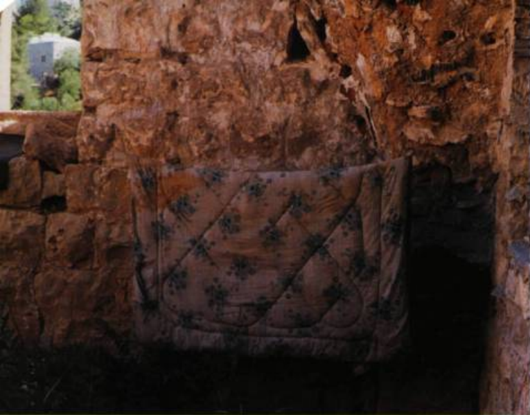
Untitled (blanket) Untitled (overgrown lane) from Lifta 6 colour prints 73.5 x 84 cm 1997–2000