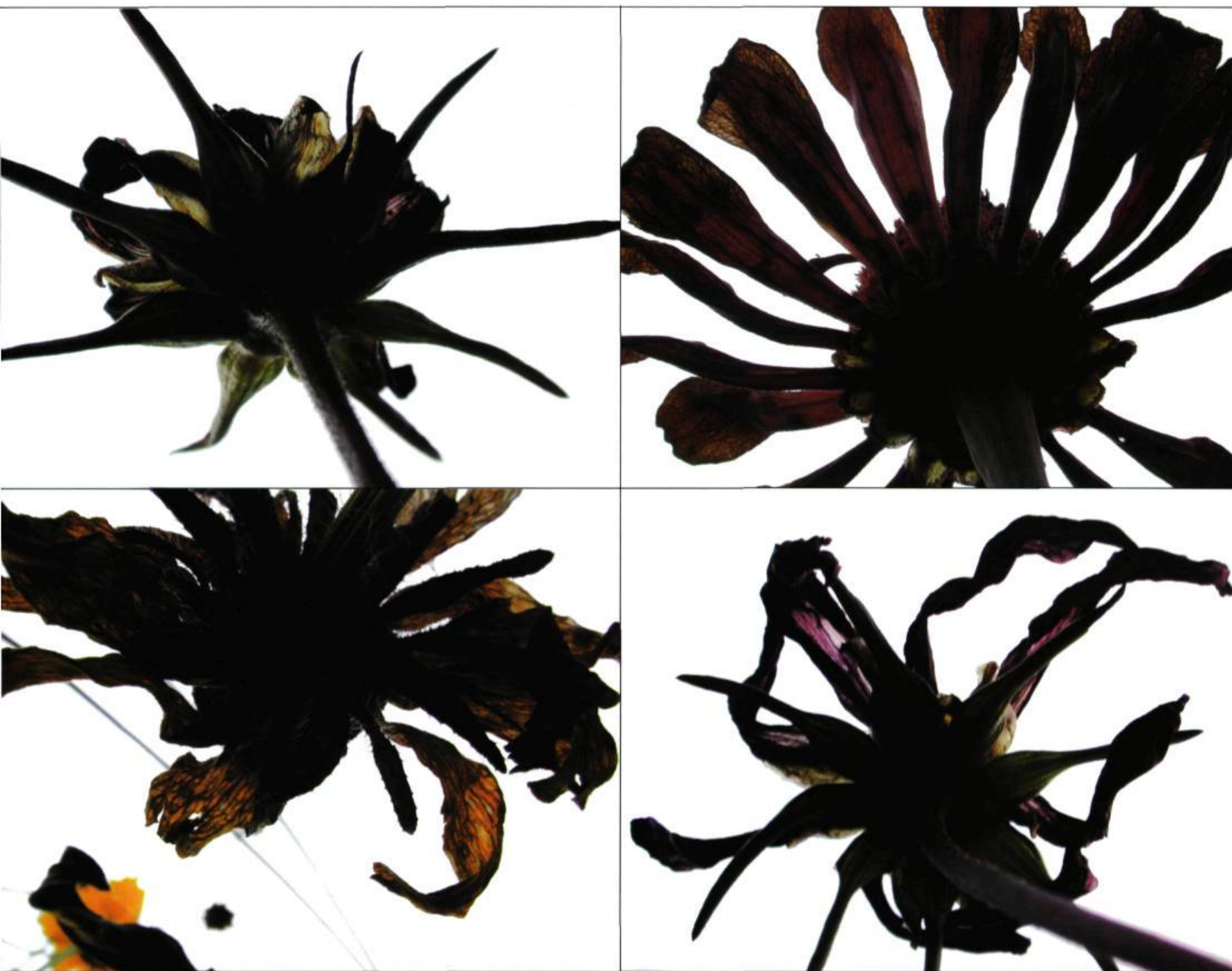
Arborescences épreuves couleur et à jet d'encre 2000