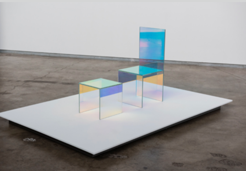
Dichroic Chair & Table, 2020