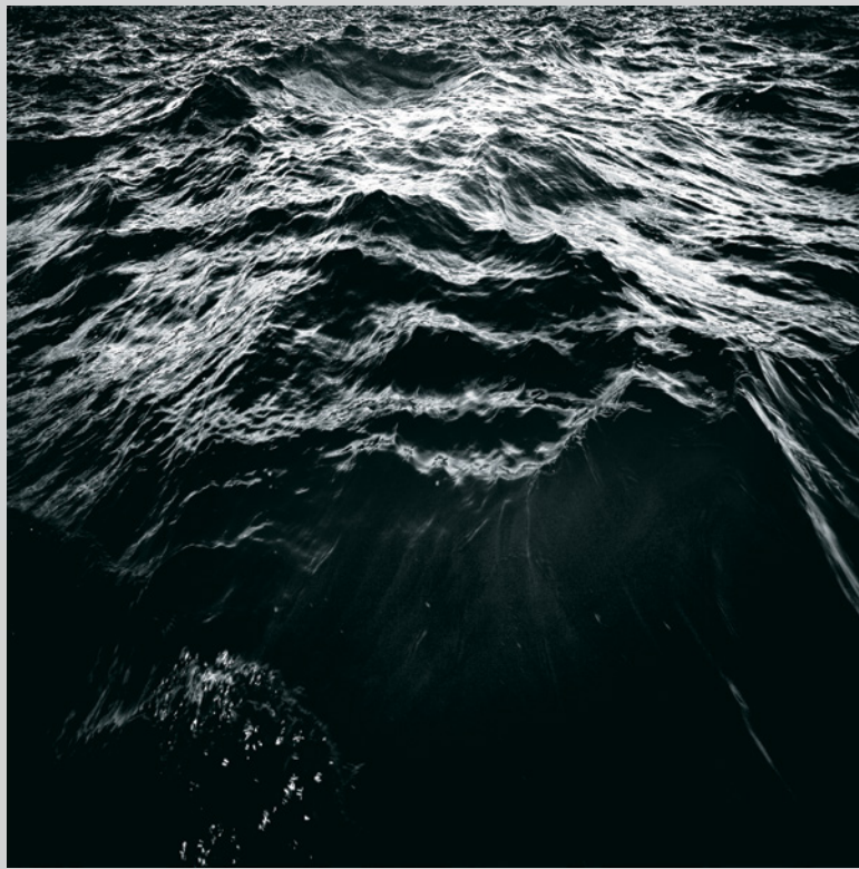
Abysses 2 , from the series PEQUOD ('pi:'kwad), 2015, inkjet print on Barite paper, 102 × 81 cm

Lefort’s images seem to have been shot at the helm of a wave-drenched binnacle, with compass and octant close at hand, and all is in a state of irredeemable flux, as the ship pitches and rolls on the face of the deep and fateful cusp of jeopardy that is the open sea. The fact that he is in a kayak and not at the helm of a large sailing ship is not immediately apparent. There seems