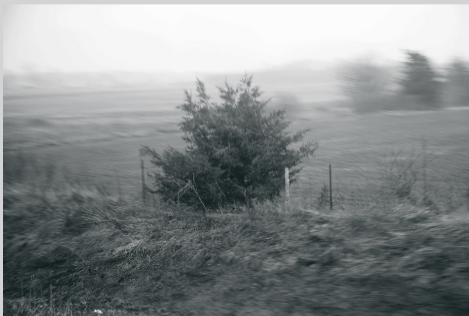
Untitled Photographic Pictures , 2015 inkjet print, 152 × 229 cm

In this series of photographs, Wright opens up a rich interpretive space by taking the motif of the empty landscape