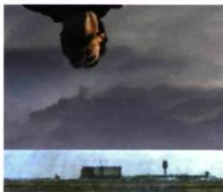
pages 16-17 Kokyu (Karl) stills from a colour video installation 2003