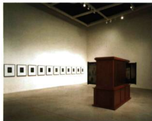
Sententia I - LXII , 1998

meuble d'archives photographiques bois de cerisier et bois laqué (cadres/tiroirs)