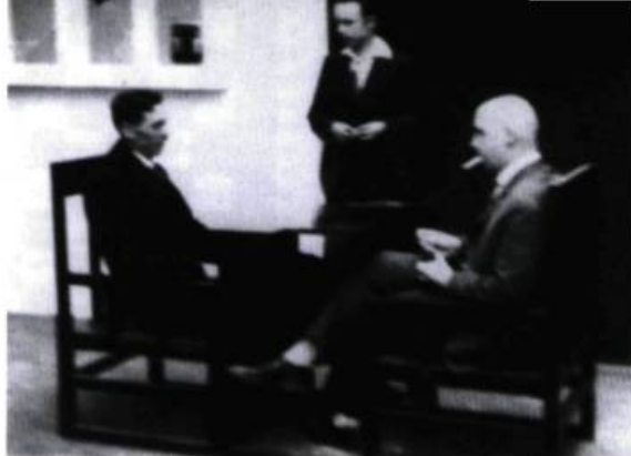
Aleksandr Rodchenko jouant aux échecs dans le coin Lénine de son club ouvrier.