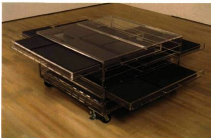
Églogue ou Filling the Landscape , 1995 cabinet en Plexiglas, 152 x 152 cm, hauteur 91 cm 6 tiroirs, 27 portfolios, environ 216 pho- tographies noir et blanc collection : Musée d'art contemporain de Montréal

practices and productions of culture, the object exists in phantom form as a modality of difference and possibility in relation to the historical a priori of discourse, the myriad ideas and practices that pre-exist it.