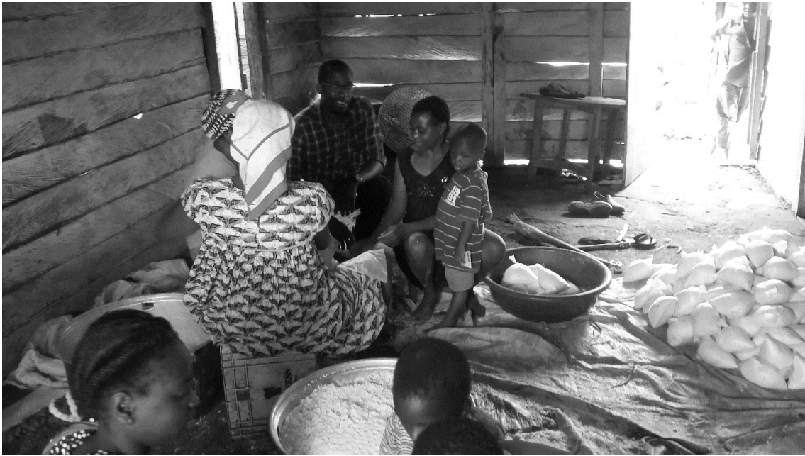
Figure 2: Meeting with farmers at Boviongo. The authors' field data gathered in 2017.