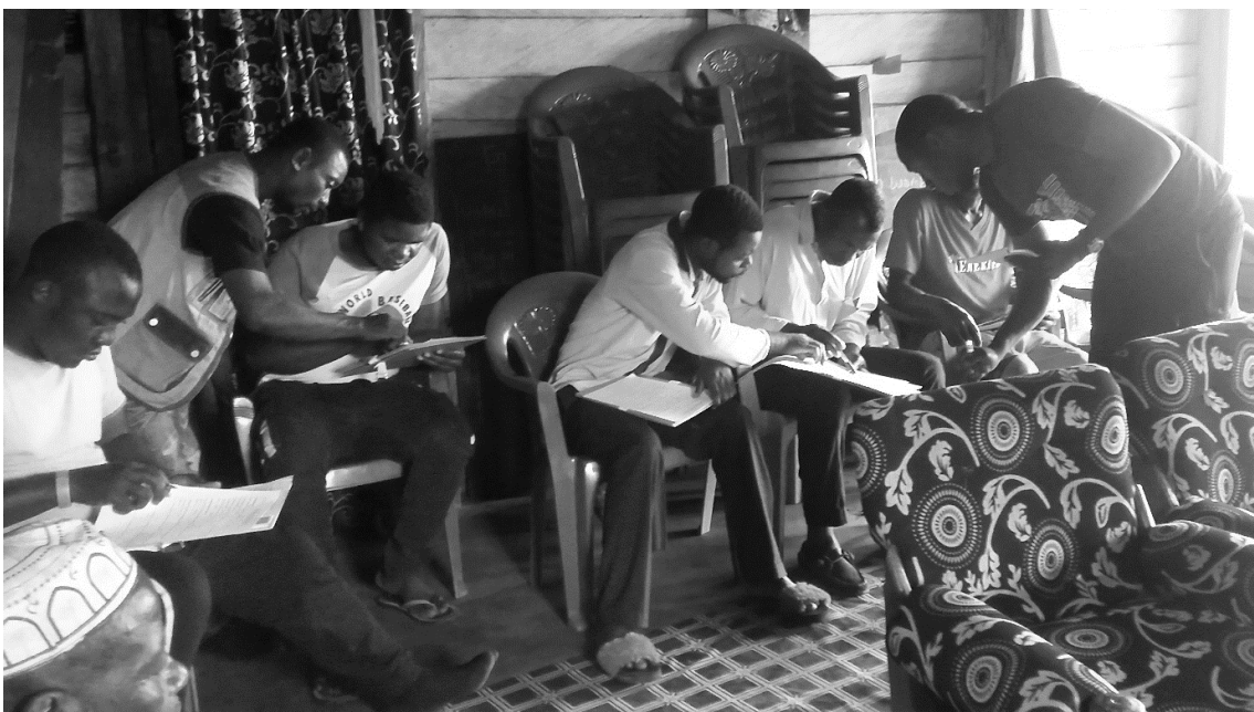
Figure 3: Conducting interviews at Munyange. The authors' field data gathered in 2017.

According to Doody et al. (2012), focus groups help researchers disclose knowledge uncovered by other methods of data collection. Consistent with this view, we reviewed unpublished data obtained from the MCNP office in Buea, targeting assessment and monitoring reports written between 2009 and 2016 by park officials, for the 41 villages around MCNP. Using this data, we were able to determine villages associated with the use of forests. To identify villages in contact with the park, we adopted Maxwell and Miller's (2008, p. 462) principle of