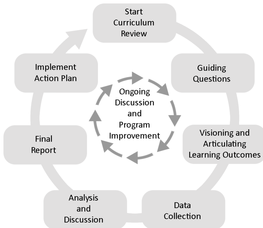
Figure 1: Elements of the curriculum review process for quality assurance (Dyjur, 2016)

Figure 1 provides a framework that identifies elements and processes that occurred as part of the curriculum review process for quality assurance. The outer circle describes the stages of the curriculum review process beginning with establishing the Curriculum Review Team, identifying guiding questions to support the process, visioning and articulating learning outcomes, identifying data sources and engaging in data collection, analyzing the findings and discussion of significances in relation to the guiding questions, writing a final report, and implementing the action plan. The inner circle captures the iterative and continuous nature of how ongoing discussion leads to program improvement through the evidence-driven process.