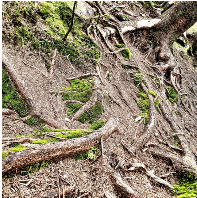
Figure 1. A rendition of a Rhizome. 1

Deleuze and Guattari (1987) introduced the concept of a rhizome as an alternative model of thought and organization to the traditional hierarchical and tree-like structures that dominated the current understanding of systems and knowledge. The rhizome represents a non-linear, non-hierarchical, and interconnected system that operates through principles of multiplicity, connectivity, and heterogeneity (See Figure 1). Deleuze and Guattari drew inspiration from the rhizomatic structure of certain plants, like the root system of a strawberry plant, which spreads in different directions with a fixed starting point that connects to other parts of the same plant or others within an ecosystem.