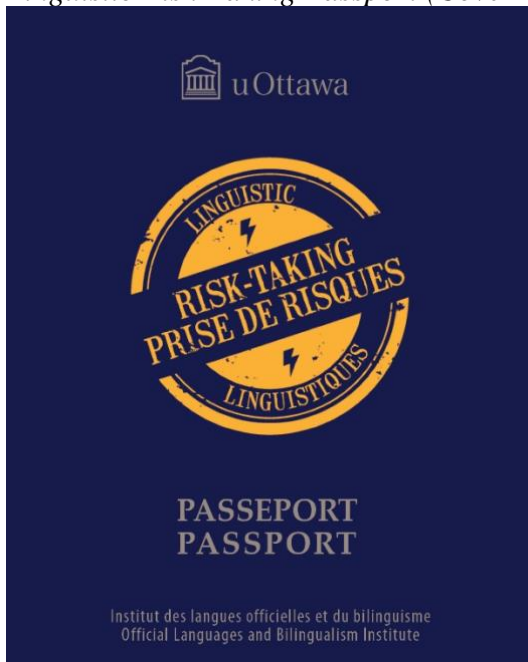
Linguistic Risk-Taking Passport (Cover Page)

The Passport currently contains over 80 such risks that range from using the second language at the library, cafeteria, or sport services, to applying for a job, speaking to a superior, singing karaoke, or submitting an academic assignment in the second language (i.e., foregoing the right to submit an assignment in the first language). The Passport exists in equivalent versions in French and English, and participants are given the version in the target language they are learning. Explanations of the construct of a linguistic risk and why it is important to take risks in language learning are included. Most risks can be repeated up to three times, which offers learners opportunities for repeated exposure to similar situations or tasks. Learners use the Passports autonomously, outside of class time as a motivational, strategic, and record-keeping tool in their daily language practice. They can choose which risks are appropriate or interesting for them and check them off in the Passport once taken. In addition, learners are asked to indicate whether they perceived each risk as High, Medium, or Low at the time they took it. Sample risks are provided in Figure 2, which represents a page from the main section of the Passport for an English learner (the risks for a French learner are equivalent).