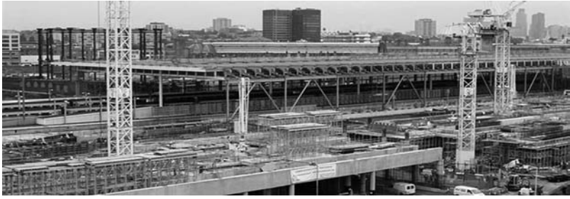
Figure 4. View of the King's Cross/St Pancras redevelopment project © Miramax, 2006.

Fainstein 2001, Frieden and Sagalyn 1989, Hannigan 1998, Milroy 2009). This contrasts quite starkly with the state-driven development of earlier projects like Alexandra Road Housing. The organisation in charge of the King's Cross project is a private development agency called the Argent Group. Its role is to generate and channel private investment capital to the restructuring of the areas between and immediately north of the two train stations. This is typical of the strategies employed by such firms which enable the development of mixed-use commercial, office and residential complexes. In principle, these are sensible and sustainable urban patterns: the different functions support each other and promote round-the-clock use of public space, which makes for safer streets and a healthy urban environment. Concordant with the shift to private development of these projects, rather than just social housing per se, the King's Cross redevelopment offers shared ownership, shared equity and a mix of intermediate-valued homes for sale and/or rent.