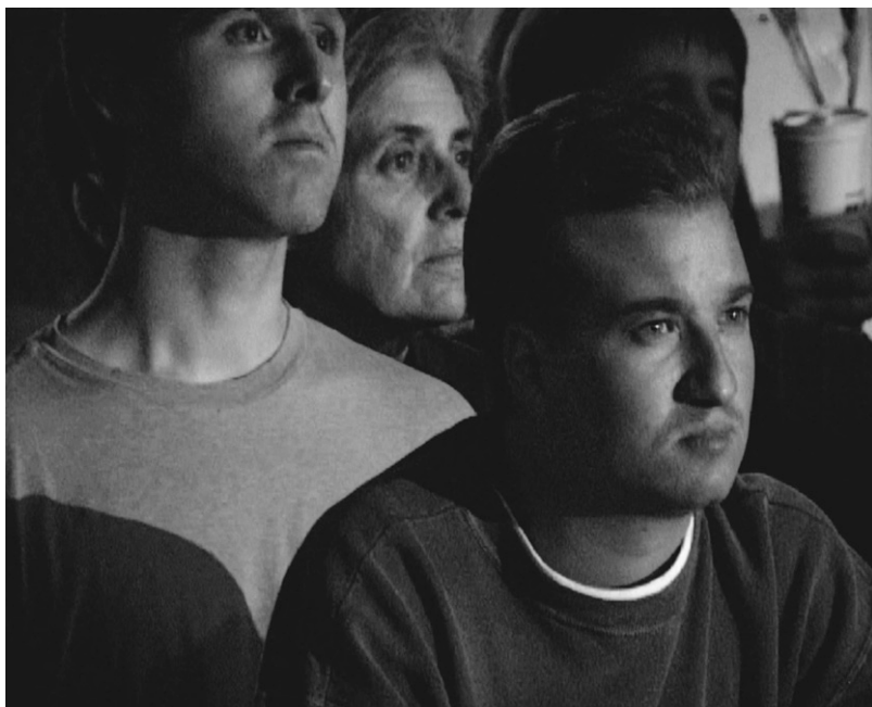
Broadway , Craigie Horsfield, © 2006. Courtesy of the artist.

disposed of as an obsolescence. They are presents themselves in that it is usually impossible to figure out which screen, in its imagery, anticipates, announces, follows or continues the other. Yet, from all these possible presents, a past present and a future present take shape.