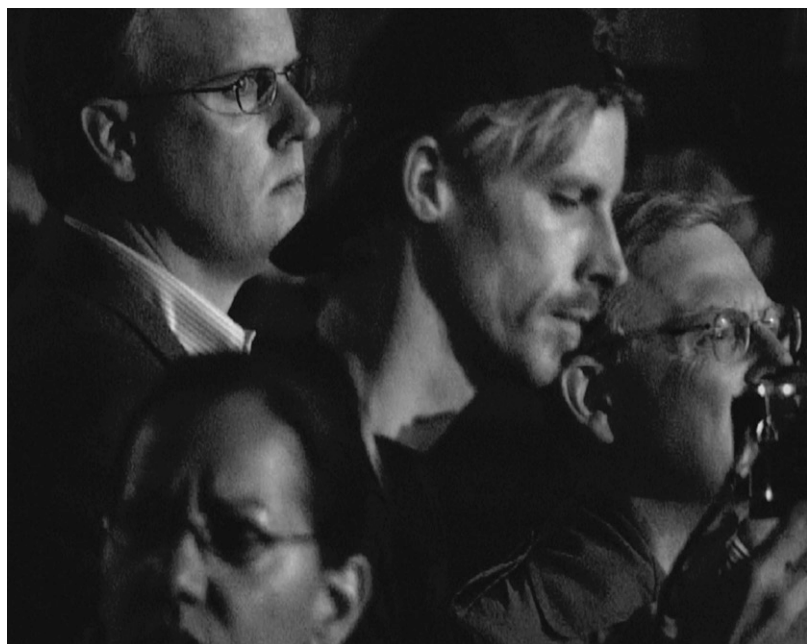
Broadway , Craigie Horsfield, © 2006. Courtesy of the artist.