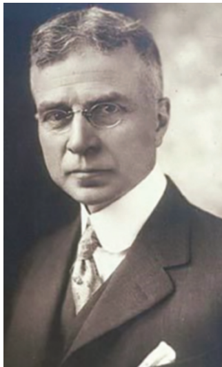
Figure 1. Casey Albert Wood (21 November 1856–26 January 1942), c. 1912. Casey Albert Wood Collection (MSG 1203), Rare Books and Special Collections, McGill Library.

prejudices and preferences.” 2 Although one rarely feels compelled to disagree with the illustrious Osler, I must point out that there are exceptions to his dictum. One thinks of the libraries of many wealthy collectors. Often resplendent with biblio-treasures and trophies, these collections are frequently assembled with strong guidance from antiquarian booksellers and other experts. There are also libraries named after worthy individuals or organizations whose primary role was to furnish the funds needed to acquire or house a collection assembled by others. Osler’s maxim is certainly relevant in those instances where an individual has been the driving force behind a library’s formation, particularly when it includes selecting the contents. Because these collections bear the strong stamp of their founders, knowing something about their lives, goals, and collecting techniques provides one with a deeper, contextualized understanding of the libraries they created.