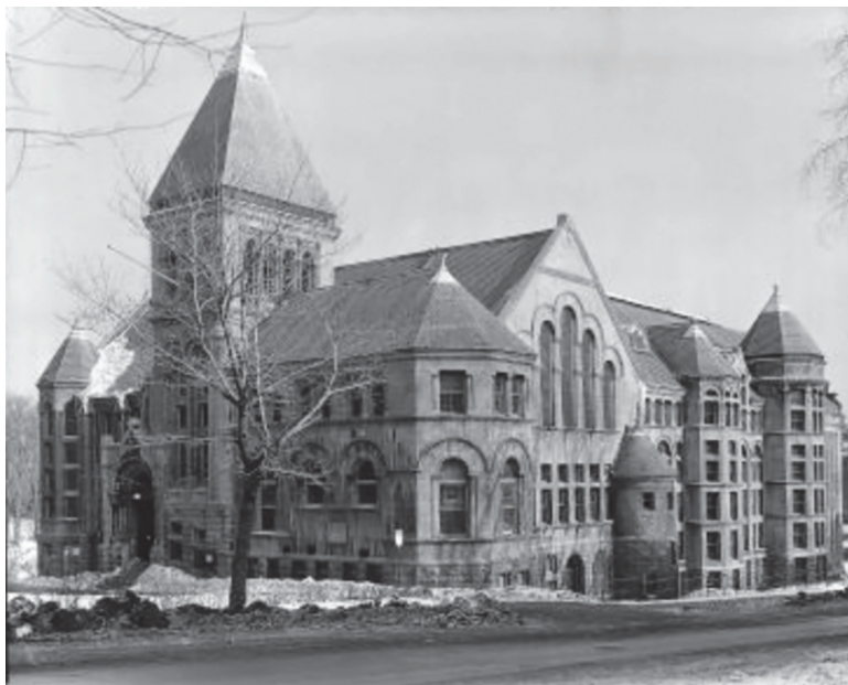
Figure 3. Redpath Library, McGill University, c. 1920.