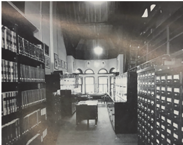
Figure 4. The Wood Library of Ornithology, 1938. Source: Edgar Erskine Hume, Ornithologists of the United States Army Medical Corps: Thirty-Six Biographies , Publications of the Institute of the History of Medicine, the Johns Hopkins University, 1st series: Monographs, vol. 1 (Baltimore: Johns Hopkins Press, 1942).

Visual material supplemented the new and out-of-print books and periodicals being acquired for the library. Both Wood and Lomer were dedicated to collecting prints, drawings, stereoscopic pictures, and lantern slides. Wood was keen that the reading room be decorated with prints and drawings, as can be seen in early photographs of the library. Both men wanted visual material, along with popular and children's books on birds, in order to fulfill another mission of the library: educating the general public about birds and the need for conservation. Letters between them, in 1920, discussed the sorts of material needed to do this. Wood recommended acquiring teaching aids distributed by the National Association of Audubon Societies, in New York. 37 Citing the popularity of a public lecture on birds given recently by a Mr. Job at the Ritz-Carlton Hotel, Lomer recommended they acquire sets of lantern slides, with the accompanying printed presentations. These could be circulated throughout Montreal and the province via McGill's Travelling Libraries network. 38