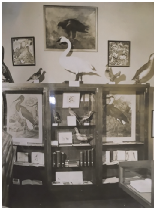
Figure 5. The Bird Exhibit, Redpath Library, 1 May–15 September 1933. The exhibit featured paintings by Lady Elizabeth Gwillim (in display case).

proprietor, “I think that before I went to France in 1914 I saw a collection of bird paintings down stairs.” Shortly afterwards this clerk appeared bearing an immense, dust-laden, but extremely well made portfolio about five feet broad and four high. I noticed that it was brass-bound, provided with a safety lock and had a wide wooden back. It must have weighed thirty pounds. On it were painted barely decipherable initials and a date—“E. G. K. 1800.” The contents amazed and delighted me. I do not claim to be an art expert, but I realized at once that the paintings of Indian birds in the pockets of that giant container were by the hand of no mean draughtsman.