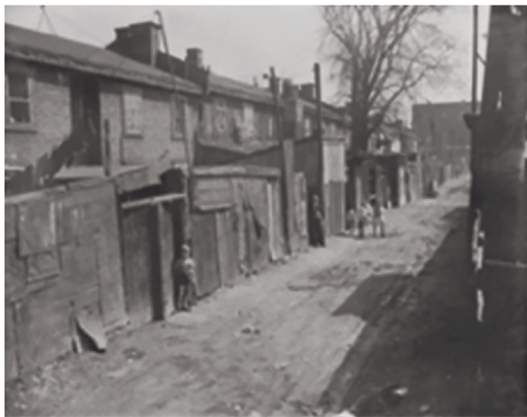
Figure 2. Even in 1946, Pointe-Sainte-Charles was an impoverished area.