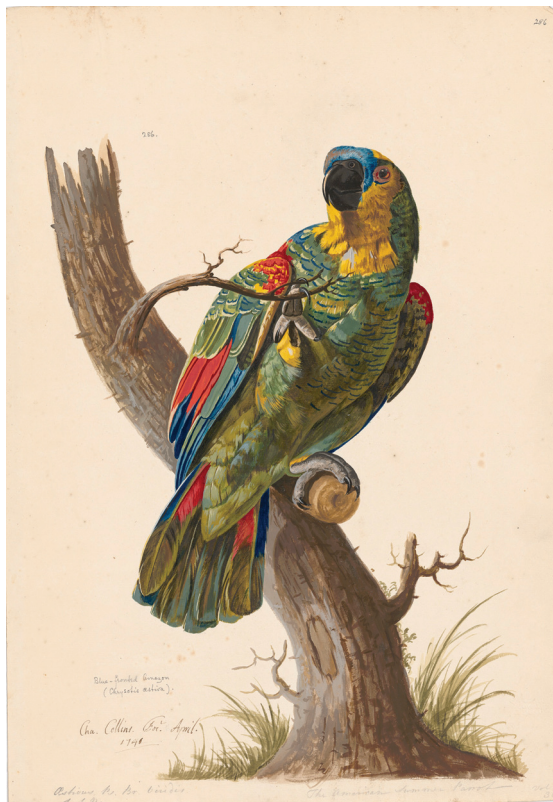
Figure 3. Charles Collins, Blue-fronted ( Amazona aestiva ), watercolour on paper, April 1740. Showing artist's signature and date; Craddock number (top right); White volume number (bottom left); Mousley identification; inscription in unknown hand (bottom right). Blacker Wood Collection, Rare Books and Special Collections, McGill Library, MSG BW002-286.