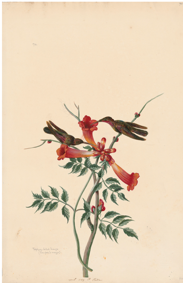
Figure 5. Peter Paillou, “Porphyry-tailed Mango” ( Anthrakorax mango ), watercolour and gouache on paper, 1754. Blacker Wood Collection, Rare Books and Special Collections, McGill Library, MSG BW002-711.

postures, Paillou must have painted some birds or mammals from living creatures, but he was obliged to paint many more from dead and mounted specimens or skins, and the depictions suffer as a result. Despite his popularity, even Paillou’s best work cannot compare with that of Collins, who professed to be not only a painter but also a watcher of birds and did indeed breathe life into his subjects.