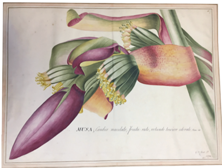
Figure 2. Georg Ehret, Musa (Banana), watercolour on paper, c1750. Blacker Wood Collection, Rare Books and Special Collections, McGill Library elf QL46 D73.

to Wood as “infantile, and worse, a crime!” 8 Wood’s purchase kept White’s zoological collections together, though sadly, the six volumes of botanical and insect drawings sold separately appear to have disappeared from public view. 9