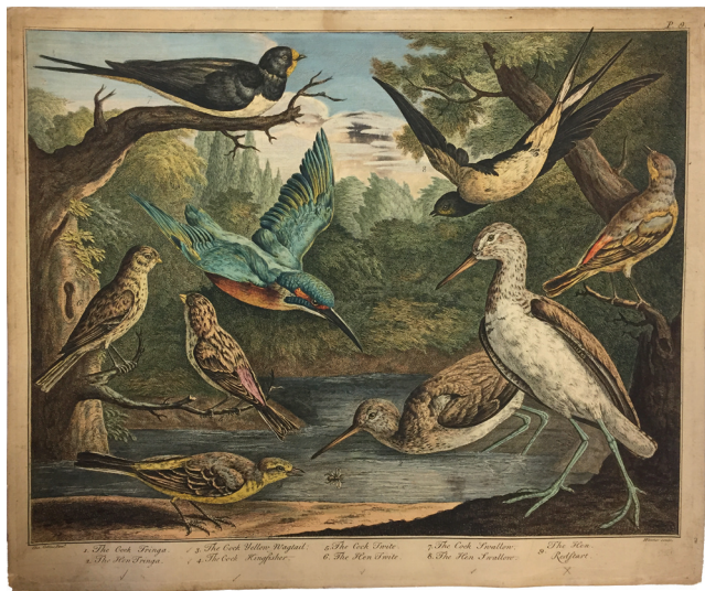
Figure 4. James Mynde, after Charles Collins, Icones Avium, cum nominibus anglicis , P. 8, hand-coloured engraving, 1736. Blacker Wood Collection, Rare Books and Special Collections, McGill Library, elf QL674 C655.

in the Icones but are now painted life-size in full colour, perched on artistically twisted twigs. They are signed and dated between 1736 and 1743. At first, White must have accepted Collins copying birds directly from the Icones , but by 1738, even if a bird was featured in the Icones , Collins was preparing fresh drawings for White, more acutely observed and corrected. For example, in the Icones , Collins depicts a pair of grey wagtails, but both birds appear similar. The pair of Grey Wagtails painted for White in 1738, however, show the appropriate sex-specific breeding plumages.