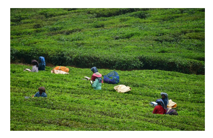
Figure 1: Women working in the tea plantations of Munnar.

Tea plantations in India are a product of colonialism, and the workers, most of whom belong to the Dalit castes (most marginalized groups) from the neighbouring states, constitute their working population. A major part of the labour workforce in these plantations comprises women workers who are engaged in tea picking, whereas men tend to be employed in other types of work on the estate. The middlemen who acted as recruiters of workers and supervisors on the estates are known as "Kanganies." Until India gained independence in 1947, most of these managerial positions were held by Europeans. This colonial legacy prevailed in the hills and the hegemony over the working class remained even after the formation of the state of Kerala in 1956 (Raman 2010, 164).