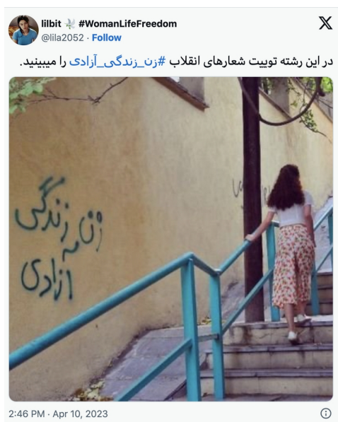
Figure 11. † Women, public space, and daily life. The writing on the wall reads: “Woman, Life, Freedom.”

In the words of W. E. B. Du Bois, a strike is “a wide basis against the conditions of work,” and the feminist strike in Iran showcases its all-encompassing basis against the conditions of living and the restrictions on freedom (1976, 67). In this light, the resounding slogan of “Jin, Jiyan, Azadi” acquires its profound significance, encapsulating the essence of their struggle.