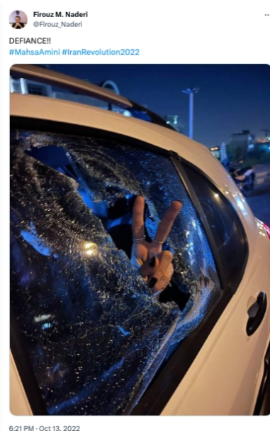
Figure 6. † “No Matter How Much You Try to Harm Me, I Will Not be Wounded; I Will Keep Sprouting.” Shared on: https://9gag.com/gag/aGEwrQw?utm_source=copy_link&utm_medium=post_share