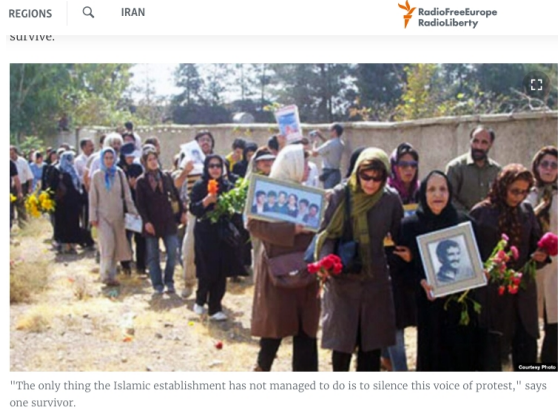
Figure 9. † Women's Syndicate of Marivan 1980s.

"The only thing the Islamic establishment has not managed to do is to silence this voice of protest," says one survivor.