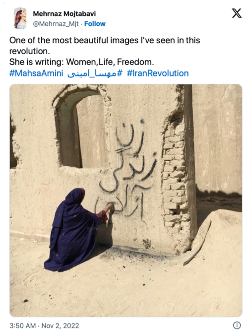
Figure 2. † The slogan “Woman, Life, Freedom” written by a Baluch woman.