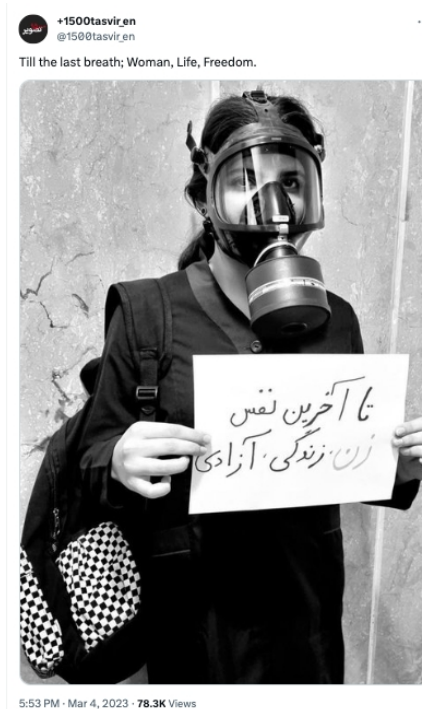
Figure 7. † Amidst a series of chemical attacks on girls' schools, a student defiantly holds a sign reading, “Woman, Life, Freedom’ Until My Last Breath.” March 4, 2023.