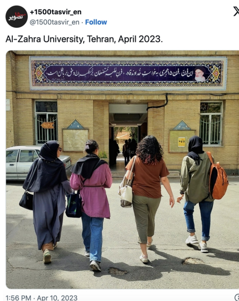
Figure 8. † Several university students entering Al Zahra University without mandatory hijab, Tehran, April 2023. Shared on: https://x.com/1500tasvir_en/status/1645410408453292034?s=20