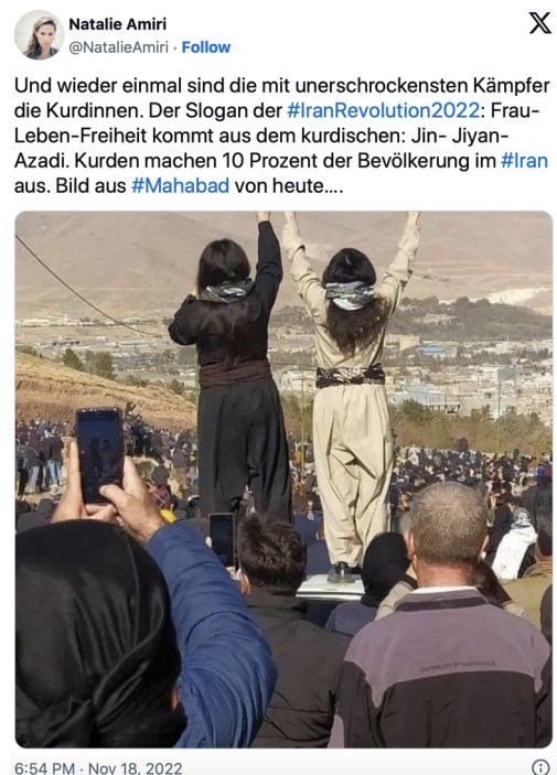
Figure 4. † Two Kurdish girls, dressed in their chosen ethnic attire, symbolizing “Woman, Life, Freedom” in the protest in the city of Mahabad, on November 18, 2022.