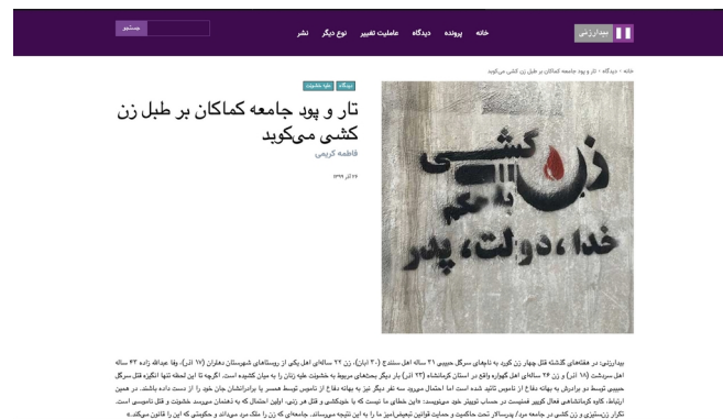
Figure 1: † Graffiti stating: "Femicide by The Law of God, State, And Father." Shared on: https://bidarzani.com/30718/

The political underpinning of veiling in Iran delineates a femicide machine within the authoritative Islamic regime. Mandatory veiling serves as the starting point for the subsequent control over women's bodies, agency, the exploitation of feminized labor, and the perpetuation of violence and feminized poverty. The mandatory act of veiling and the control over women's bodies function as crucial components within Iran's femicide machine, employed as an axis for the state's radicalization.