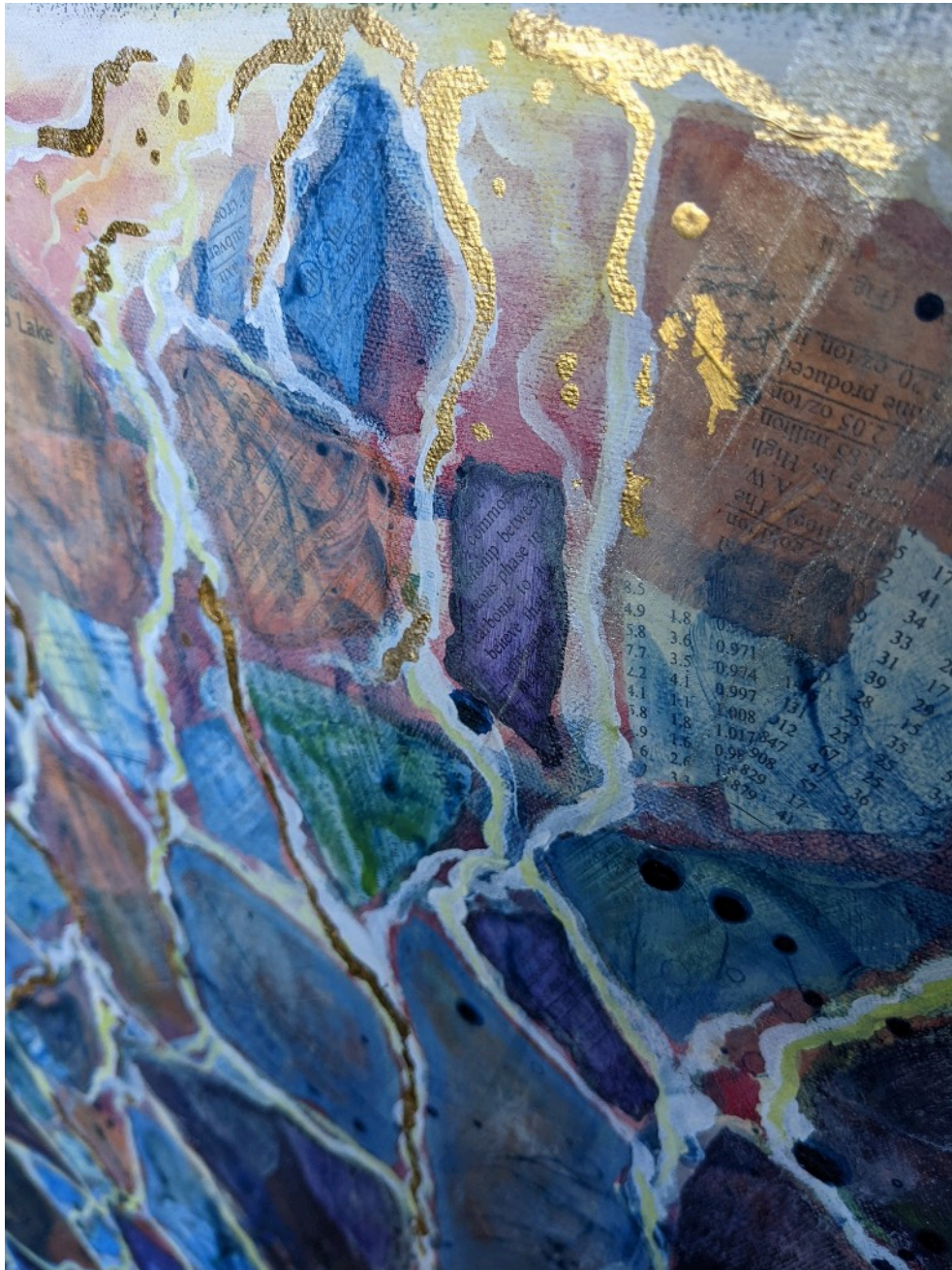
Figure 4 Red Lake, gold leaf detail