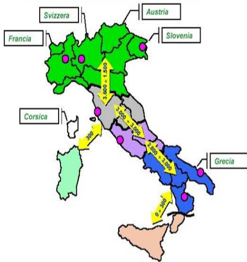
Fig. 3. Transmission capacity between the geographic zones and border connections

divided into geographic zones that are connected by a limited transmission capacity which often causes congestion problems (Figure 3).