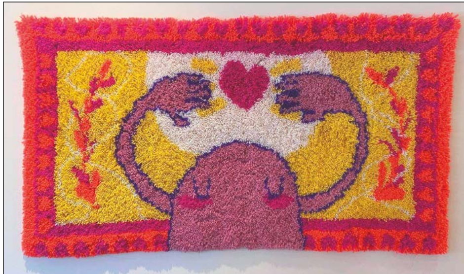
Figure 5. Fern Pellerin, ME MANGAV TUT, 2020; wool yarn, rug canvas, cotton thread; 29” x 59”.

labour of love, each fibre tied precisely to the grid of its canvas, but the result is soft and fluid. “Every time Fern installs it,” González de Armas says, “they fluff it a little bit. ... Each time the lines shift just a tiny bit.” The whole piece is easily shifted, too; you can take a small rug with you when you move. Wherever my toes sink into bright fluffy wool, that’s my home.