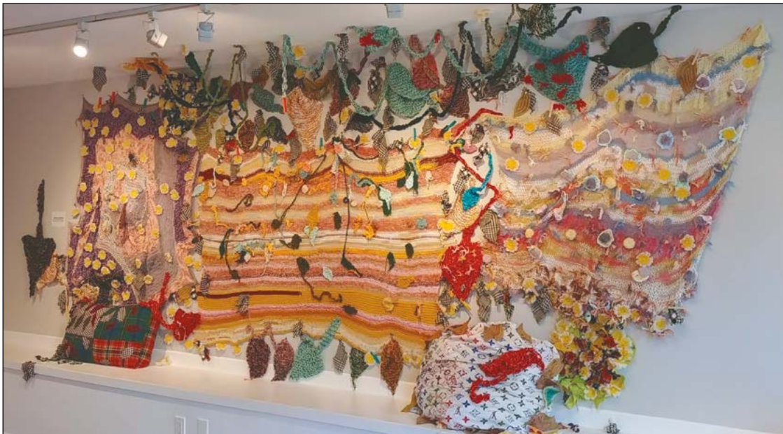
Figure 1. Anna-Lisa Shandro, Back to your roots , 2020–2021. Large assortment of different sized textile pieces, integrated textile foliage, pillows, and a simple wood kitchen chair.

Shandro plans to make it her living room decor when she moves house. This appeals to me too, a den in the woods made into a blanket fort. I would settle down inside it and fondle its fuzzy forms, daydreaming with my fingers.