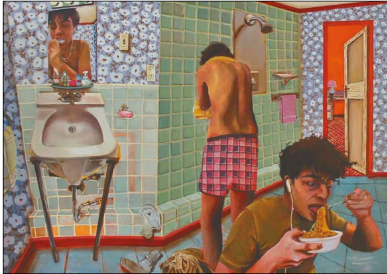
Figure 6. Kayza DeGraff-Ford, The Bathroom , 2019. Oil on canvas, 60” x 84”.

is a public one at NSCAD University, which all the art students recognize, and the shower is coin-operated. She thinks the painting speaks to “the social reproduction of labour, the kind of work that we do that often gets reframed as self-care when it’s really work that we do in order to be able to do work that is economically productive for other people.” In this sense, The Bathroom is a companion piece to Back to your roots , which relates to the “creative impulse, things that we do almost purely for pleasure.”