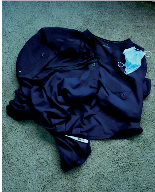
Wishing I could discard a day's worth of worries as easily as this uniform.