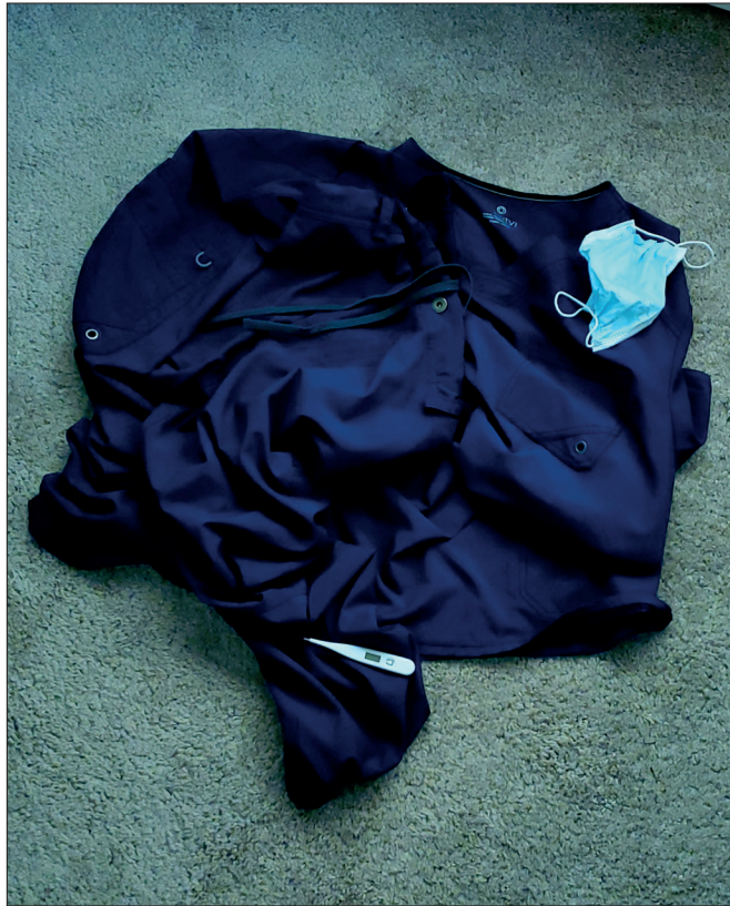
Wishing I could discard a day's worth of worries as easily as this uniform.