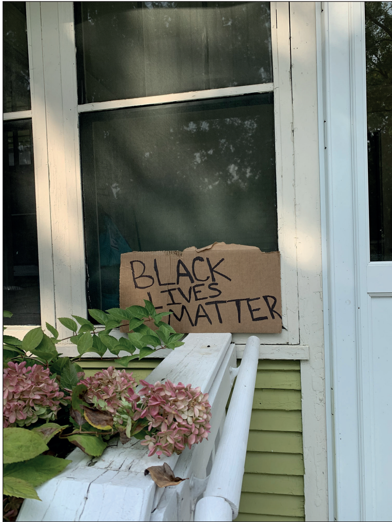
While I am inside debating my role, this poster, standing for the activism I believe in, sits outside.

11 July 2020. As if a pandemic and rigorous pre-med coursework were not enough to handle, news broke of the murder of George Floyd at the end of May 2020. Murdered just 81.3 miles from my house, Floyd's death has ignited conversations and protests against police brutality across the world. As an activist, Woman of Colour, and essential healthcare worker, I'm conflicted. As an advocate, I'm urged to join my community and (quite literally) stand up to the racist systems that aid and abet police brutality. However, a pandemic is raging, and I work with people at high risk of adverse outcomes if they were to contract COVID-19. How do I advocate for the dismantling of racist systems that are killing people without risking the lives of the people I work for?