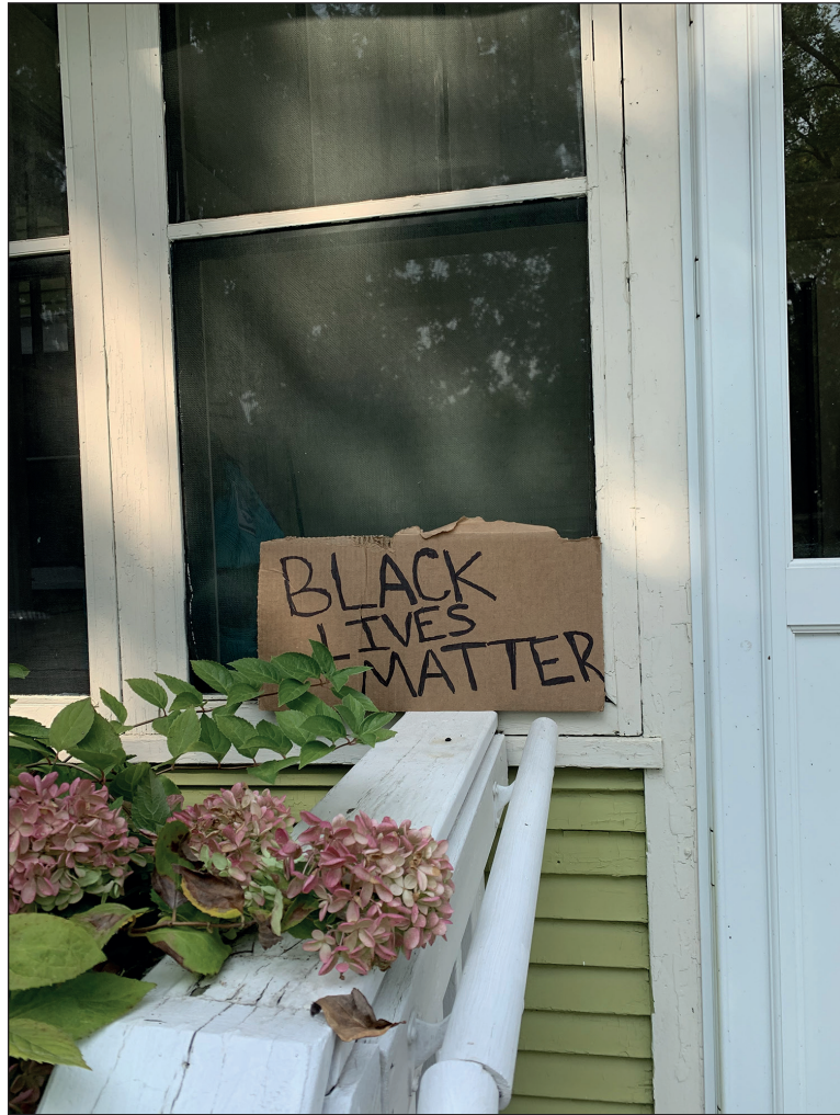
While I am inside debating my role, this poster, standing for the activism I believe in, sits outside.

II July 2020. As if a pandemic and rigorous pre-med coursework were not enough to handle, news broke of the murder of George Floyd at the end of May 2020. Murdered just 81.3 miles from my house, Floyd's death has ignited conversations and protests against police brutality across the world. As an activist, Woman of Colour, and essential healthcare worker, I'm conflicted. As an advocate, I'm urged to join my community and (quite literally) stand up to the racist systems that aid and abet police brutality. However, a pandemic is raging, and I work with people at high risk of adverse outcomes if they were to contract COVID-19. How do I advocate for the dismantling of racist systems that are killing people without risking the lives of the people I work for?