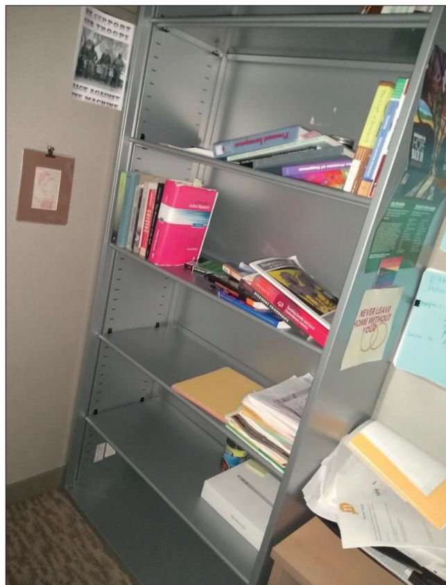
Past lives.