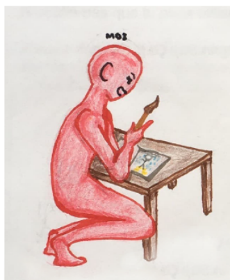
Figure 2. Tina drew a picture of herself journaling as one of the activities she enjoyed the most during the pandemic

One of our main lessons learned from using photo journals was the importance of prioritizing the process over the results. For some participants, the journaling project was an opportunity to learn about themselves, to develop a new skill, and to feel motivated during the pandemic (Figure 2).