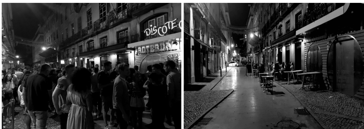
Figure 4. A comparison between nocturnal scenes before (September 2019) and during the COVID-19 pandemic (June 2020) on the world-famous Pink Street in the Cais do Sodré

As described in the previous section, tourists and Erasmus students enjoyed the pandemic Lisbon's nights drinking in the middle of the crowded streets of Bairro Alto and Cais do Sodré, while the police were punishing the youths of the working-class suburban neighborhoods of the city. In fact, the eagerness to reopen the city should come as no surprise. According to the Strategic Plan for Tourism in the Lisbon Region 2020-2014 , the nightlife is the primary reason to visit the city for a significant 18% of tourists and visitors (p. 112). Facing that, it is striking that clubs and discotheque were not allowed to re-open despite the city's opening to tourists and visitors during the pandemic summer of 2020. However, one of the reasons would have to do with the negative impacts derived from the expansion of tourism-oriented nighttime leisure economy over the past years that have undermined community livability and the coexistence between partygoers (most of them tourists and international students) and city residents (e.g., Nofre et al. 2017, 2019, 2020).