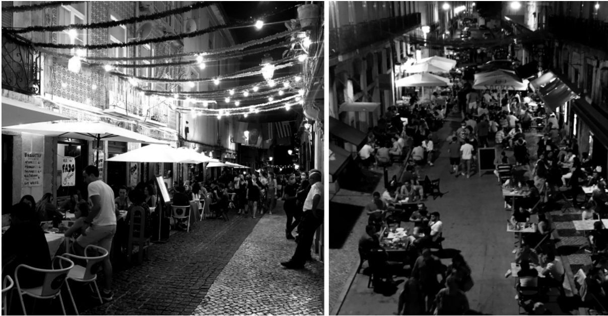
Figure 3. A Lisbon's night during the pandemic summer of 2020, in September 2020: Diaria das Notícias Street in the historical neighborhood of Bairro Alto (left), and Pink Street in the former harbor quarter of Cais do Sodré (right).

parties in domestic spaces at late night hours, and gatherings of dozens drinking in several belvederes and viewpoints of the city center such as in Miradouro de Santa Catarina, Miradouro de São Pedro Alcântara, Miradouro do Torel, Miradouro da Nossa Senhora de Graça, or Miradouro de Santo Estêvão, led Lisbon City Council to flood the city with street ads claiming "Do you know who else does not miss an illegal party? This virus" (see Figure 2 above). However, such a punitive message seemed not to affect tourists, visitors, and Erasmus students temporarily living in the city (see Figure 3 below).