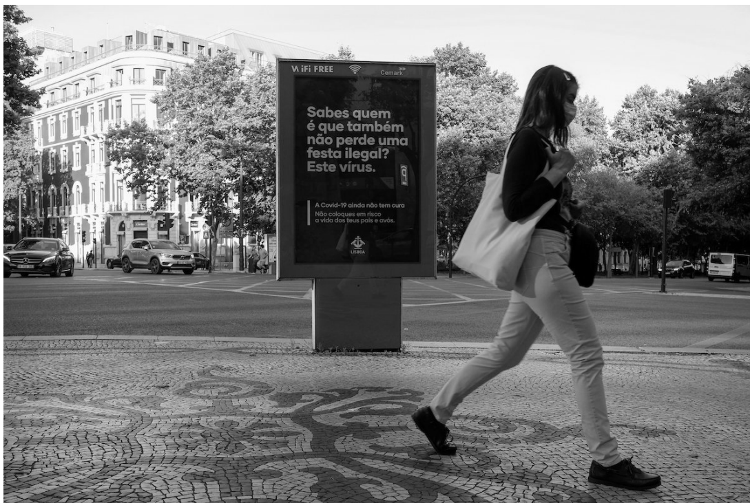
Figure 2. COVID-19 related street ad, by Lisbon City Council. June 2020.

Doubtlessly, such an enormous institutional effort to keep Lisbon as a COVID-free city demanded avoiding any potential threat that might jeopardize the recovery of urban tourism. For that very same reason, an extremely punitive institutional-civic front (Aramayona and Nofre 2021), with intense participation from television outlets and newspapers, emerged in the public opinion sphere by criminalizing the young people (especially from the suburbs working-class), accusing them of acting against the main national interest – i.e., not public health but the national economic recovery. Media started reporting how suburban working-class young people continued to drink on their ghetto streets and that police violence might, therefore, in some way be justified (e.g., Lusa 2020a, Rainho 2020). Also, as part of this punitive institutional-civic front , the Portuguese government reinforced the confinement of Lisbon working-class suburbs, including those located in its metropolitan area (Council of Ministers Resolution, No. 45-B / 2020, of June 22). Furthermore, article 5.B.6 of this resolution stated that, in the Metropolitan Area of Lisbon, the consumption of alcoholic beverages in public space was prohibited, with the exception of restaurant terraces. This meant that one of the most popular socialization practices in the working-class suburbs of Lisbon (drinking a beer on the street with friends) got prohibited.