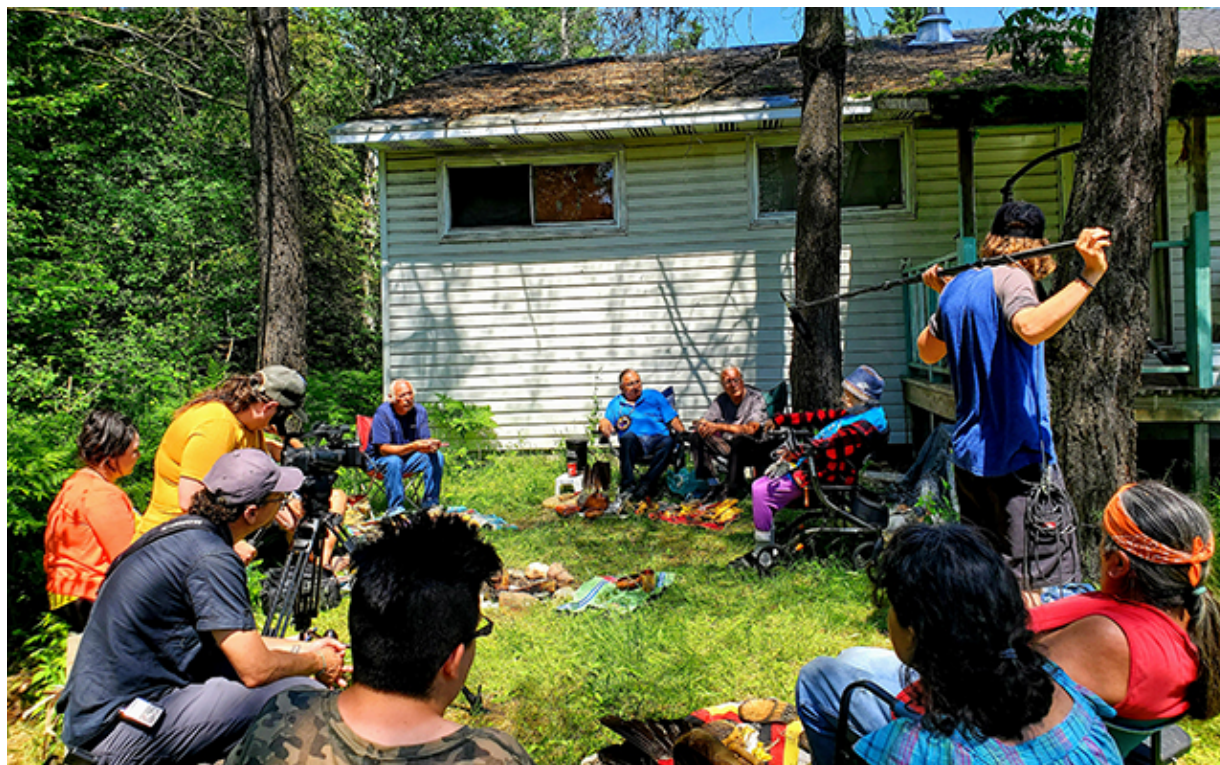
Image 5. Filming ceremonies

Like many Indigenous nations, we have a tremendous inherited responsibility to look after many jurisdictions. Beyond just fisheries, we also have forestry obligations, land obligations, minerals and resource obligations, water obligations and much more. We have so many things that have to be preserved.