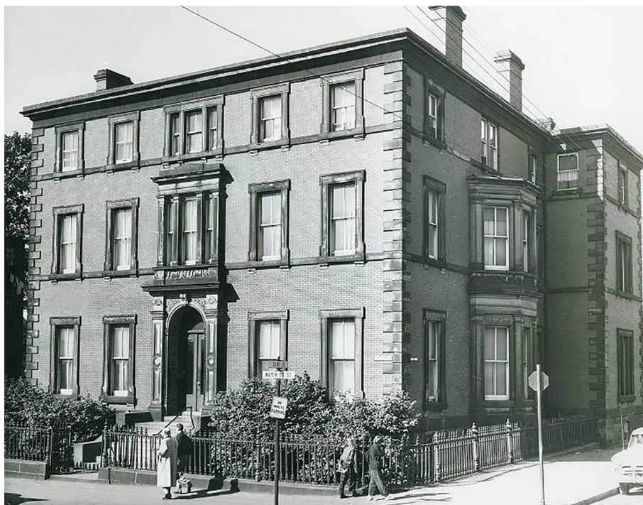
Figure 6 – Carvill Hall, 71 Waterloo Street, Saint John, New Brunswick.