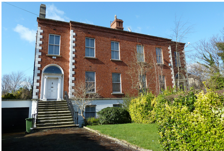
Figure 5 – Number 3 Rostrevor Terrace, Dublin.