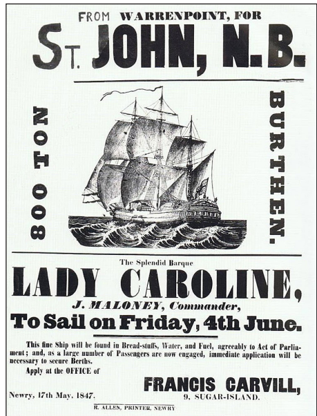
Figure 2 – Poster by Francis Carvill advertising for passage on a ship from Ireland to New Brunswick, 17 May 1847.

Like many of their fellow North American traders, many timber merchants were also investors in shipping in Saint John. 60 With a product destined mainly for ports in Britain and Ireland, these timber merchants could increase profits