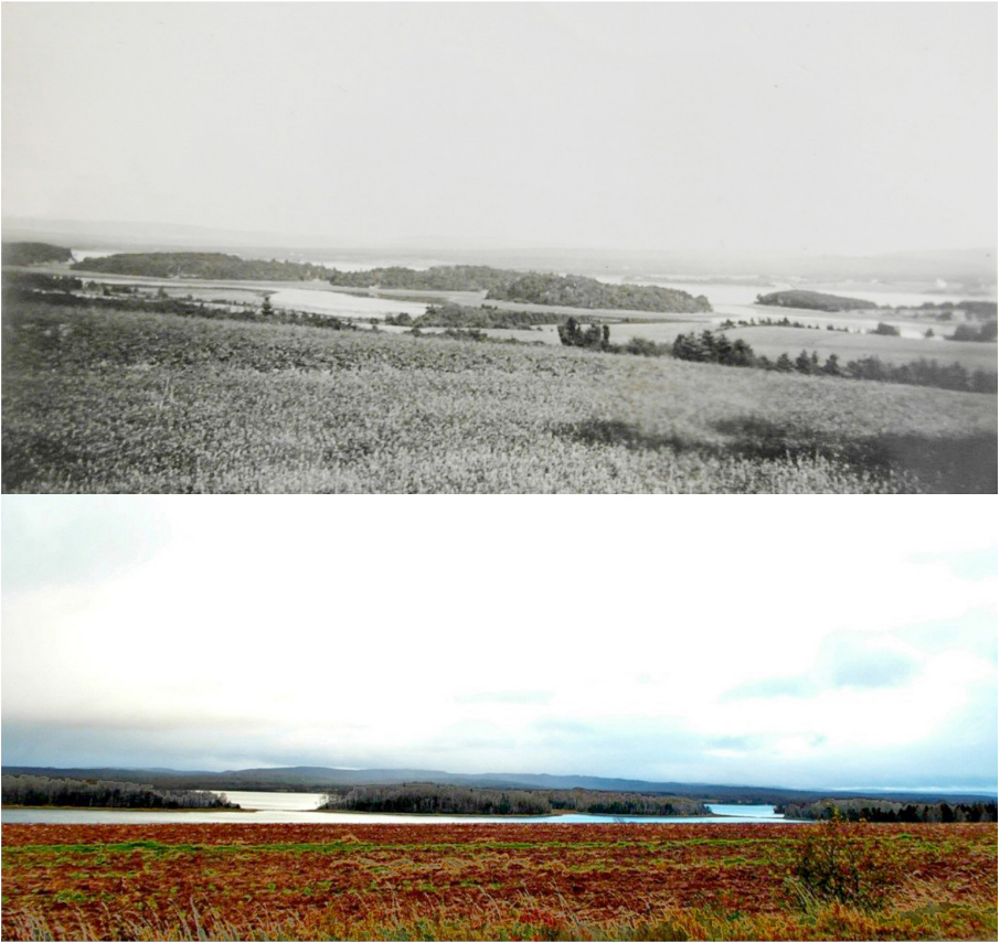
Figure 1 – View of Merigomish Harbour and Pig Islands from Big Island, c. 1920 and 2015.