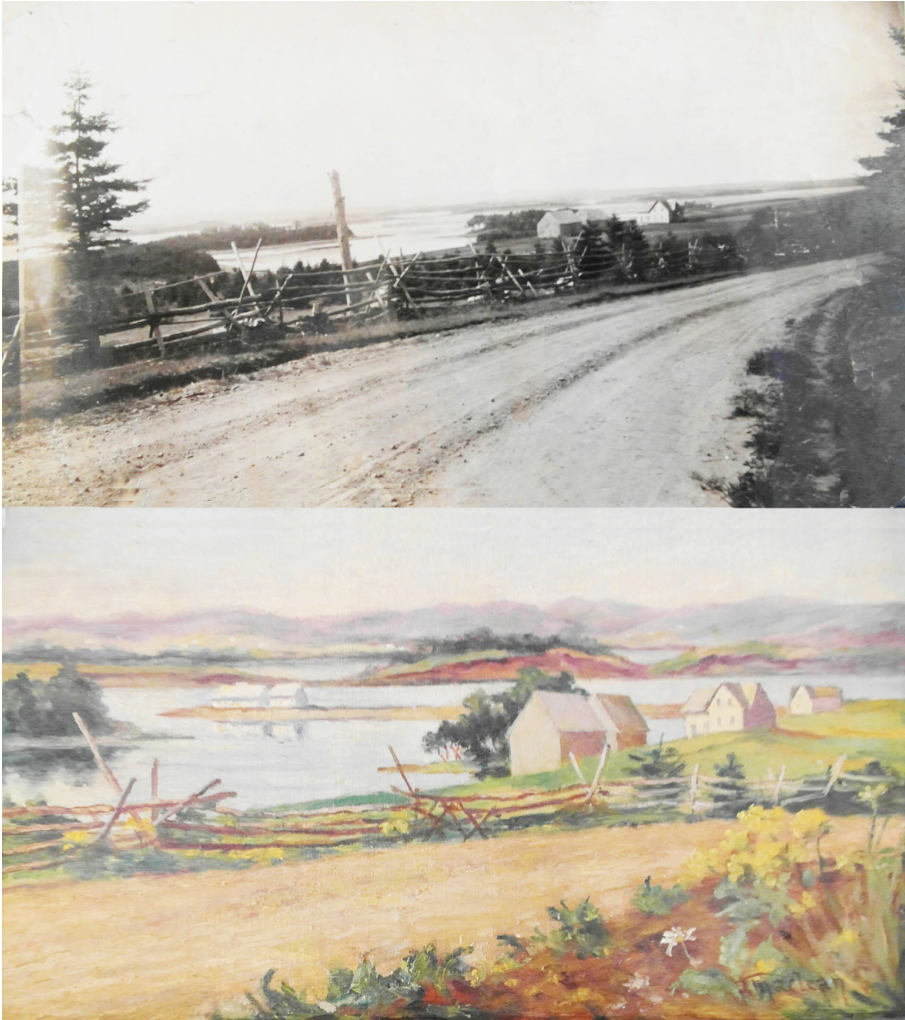
Figure 6 – A visual and artistic representation of Scottish settlement patterns and their legacy on the Nova Scotia landscape: Big Island looking toward Savage Point, as photographed and painted by Jean MacLean, c. 1920.