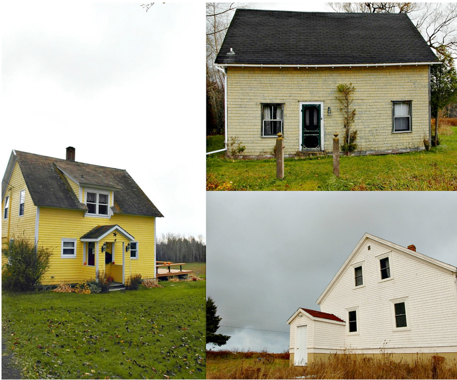
Figure 5 – A selection of surviving original farmhouses on Big Island from the second major wave of Highland settlement in the 19th century. Clockwise from top right: MacGlashan house (c. 1843), MacLean house (c. 1838), and Cameron house (c. 1835). Approximate dates are based on the year each family immigrated and settled on the Island, but it is important to note that the houses could have been built earlier or later than these dates. 55