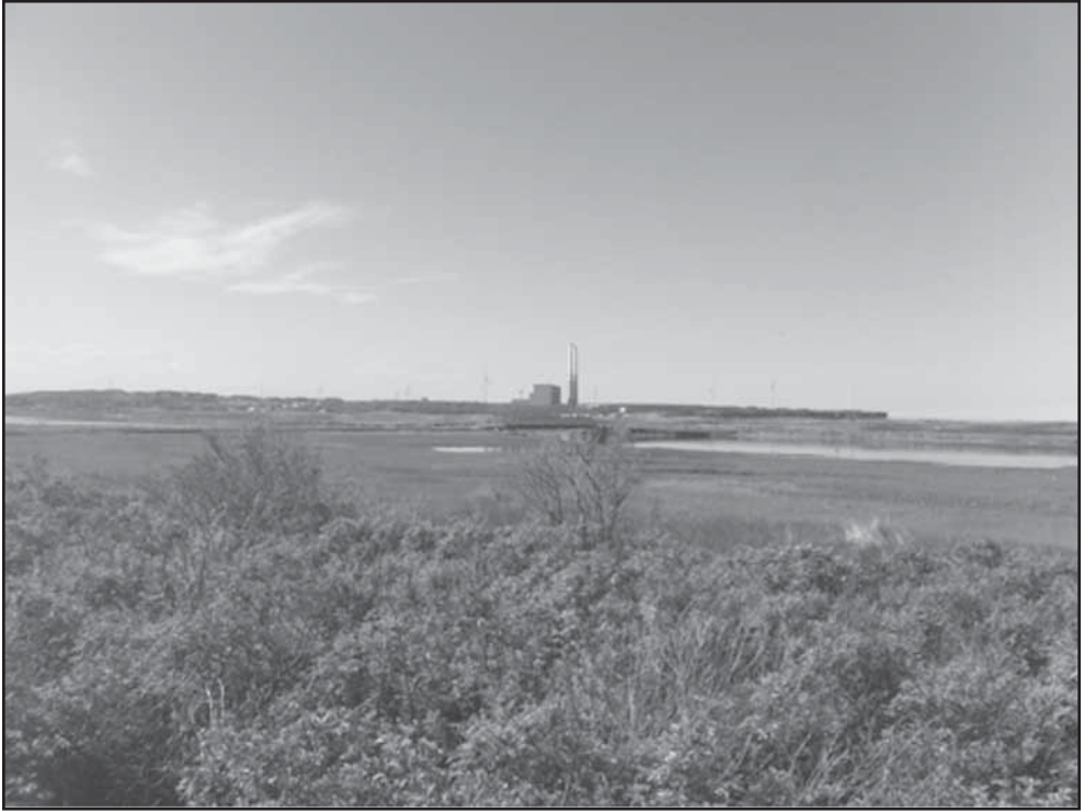
Figure 4: Lingan Generating Station near New Waterford, Cape Breton (2013). Nova Scotia Power's largest generating station, originally solely coal-fired but now with wind turbines.