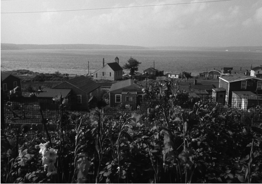
Africville, ca. 1964.