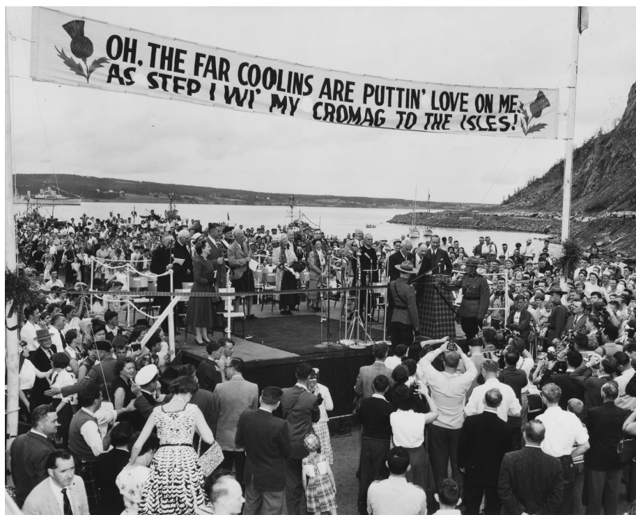
Figure 4: Premier Henry Hicks and the assembled crowd look on as C.D. Howe uses an ancient Scottish claymore (two-edged broadsword) to cut the Nova Scotian tartan ribbon. The claymore is said to have been at the Battle of Culloden in 1746. See The Canso Crossing's History and Impact: Gut of Canso Museum and Archives, http://www.virtualmuseum.ca/pm.php?id=record_detail&fl=0&lg=English&ex=00000222 (accessed 8 April 08).

ceremony to capture prime locations to witness the event. 41 Thousands of copies of the Official Souvenir Program , along with Lawrence Doucet's commemorative pamphlet, The Road to the Isle , were produced for distribution to attendees.