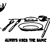
ALWAYS USES THE SAME DISHES AND BOILS THEM IN WATER BEFORE WASHING WITH OTHER DISHES,—