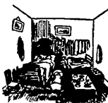
CROWDED SLEEPING LYING AND WORKING ROOMS.