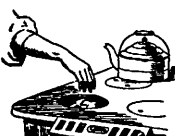
BURNS OR BOILS IT BEFORE IT DRIES,—