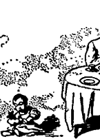
THE GERMS MAY ENTER THE BODIES OF CHILDREN PLAYING ON THE FLOOR, THROUGH SORES OR WOUNDS.