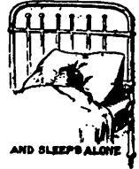
AND SLEEPS ALONE