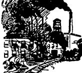
SMOKE AND DUST.