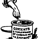
OR PUTS IT INTO A DISINFECTANT,—