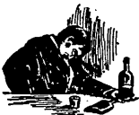
INTEMPERANCE AND OTHER EXCESSES.