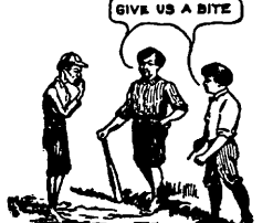
PUTTING FOOD, MONEY, PENCILS ETC. INTO THE MOUTH AFTER A CONSUMPTIVE HAS POISONED THEM WITH HIS SPIT.