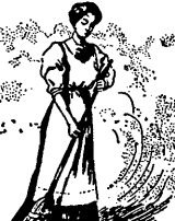
THE SPIT DRIES AND CARELESS SWEEPING, DUSTING OR DRAUGHTS CAUSE THE GERMS TO FLOAT IN THE AIR.