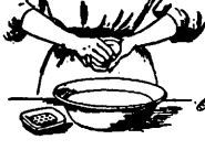
WASHES HER HANDS BEFORE AND AFTER EATING—