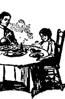
OTHERS MAY GET THE DISEASE BY BREATHING OR SWALLOWING THE GERMS. SPRAY GIVEN OFF IN SNEEZING OR COUGHING CONTAINS GERMS IN A MOIST AND ACTIVE STATE.