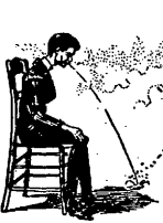
CONSUMPTIVE SPITTING ON FLOOR. FLIES FEEDING ON IT, CARRY THE GERMS OF THE DISEASE TO FOOD.