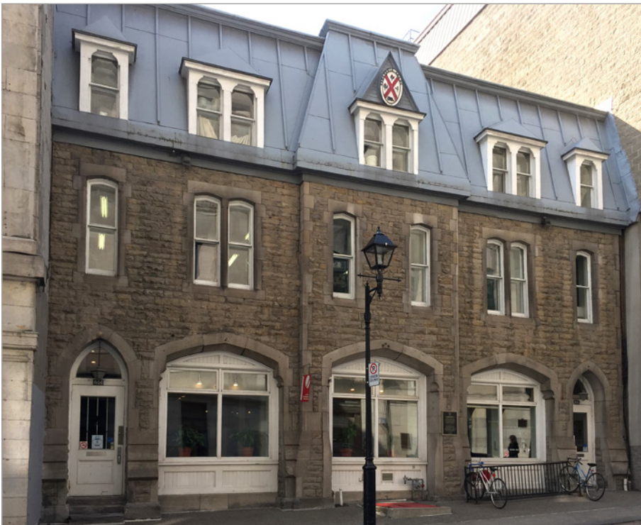
FIG. 5. LOWER SECTION OF STATION NO. 2, 444-448 RUE SAINT-GABRIEL, MONTRÉAL. | J.T. STUBBS, 2020.

But this bare-bones design was not typical of Browne's other work in the mid-1860s,