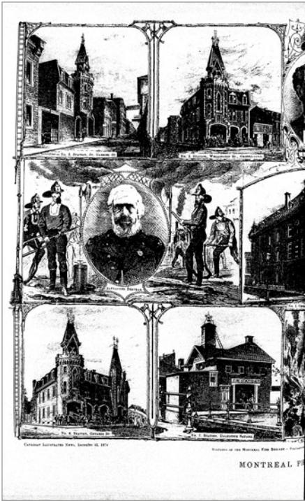
FIG. 3. "MONTREAL FIRE DEPARTMENT" [LEFT HALF] | CANADIAN ILLUSTRATED NEWS, DECEMBER 12, 1874, P. 376.