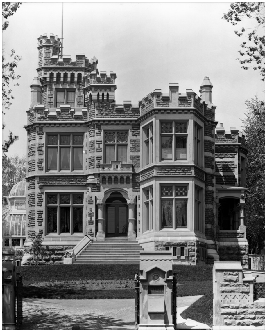
FIG. 8. WM. NOTMAN & SON, “ROKEBY,” ANDREW FREDERICK GAULT’S HOUSE, SHERBROOKE STREET, MONTRÉAL, ABOUT 1885. | VIEW-2464 © MCCORD MUSEUM.

unlimited freedom for invention. Some of Browne’s various borrowings marry historic solutions with contemporary needs, for example the broad Tudor arches created openings of sufficient width to allow the passage of the fire engines; 42 but most are purely decorative, and unlikely to have been references to specific models. If the building style cannot easily be labelled “Gothic,” how then can it be described? One promising possible answer to that question is “Picturesque.”