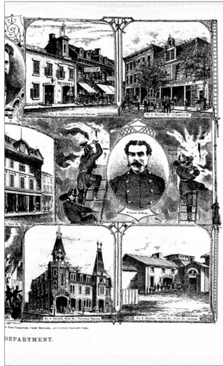
FIG. 4. "MONTREAL FIRE DEPARTMENT" [RIGHT HALF] | CANADIAN ILLUSTRATED NEWS, DECEMBER 12, 1874, P. 377.

same architectural "style": one with a single tower (used for stations 2 and 3), and one with a double tower, used when the fire station was combined with an adjacent police station (stations 6 and 8). All four structures were demolished at a later date, with the sole exception of the lower section of Station no. 2, which today survives in part, although without its tower, now at 444-448 Rue Saint-Gabriel (fig. 5).