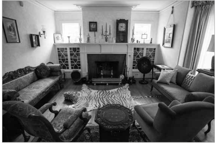
FIG. 3. FAR END OF THE WYATT HISTORIC HOUSE MUSEUM'S FRONT ROOM.