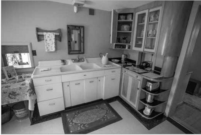
FIG. 12. A CORNER OF THE KITCHEN IN THE WYATT HISTORIC HOUSE MUSEUM, FEATURING THEIR KITCHEN QUEEN SINK. | ADAM KIRKEY, 2014.