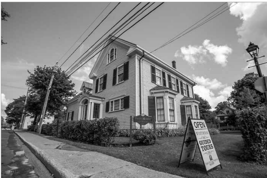
FIG. 1. THE WYATT HISTORIC HOUSE MUSEUM OR "WYATT HOUSE," LOCATED AT 85 SPRING STREET IN SUMMERSIDE, PRINCE EDWARD ISLAND. | ADAM KIRKEY, 2014.

This essay argues that historic house museums can be reconceptualized to serve as effective sites of narration for important and seldom acknowledged women's histories. Despite the nineteenth and early-twentieth centuries correlation between women and domestic spaces, many Canadian house museums were created to preserve the histories of prominent male figures from our past. I argue that the Wyatt Historic House Museum operates outside of that model and is a unique example of a house museum that highlights diverse women's