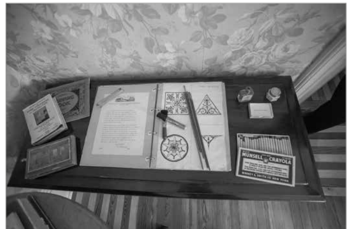
FIG. 9. A SELECTION OF DOROTHY WYATT'S ART SUPPLIES ON DISPLAY IN HER BEDROOM. | ADAM KIRKEY, 2014.

used to contest previously held assumptions about separate sphere ideologies.