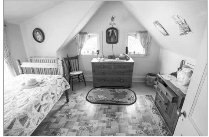
FIG. 13. THE "HIRED GIRL'S ROOM" IN THE WYATT HISTORIC HOUSE MUSEUM.