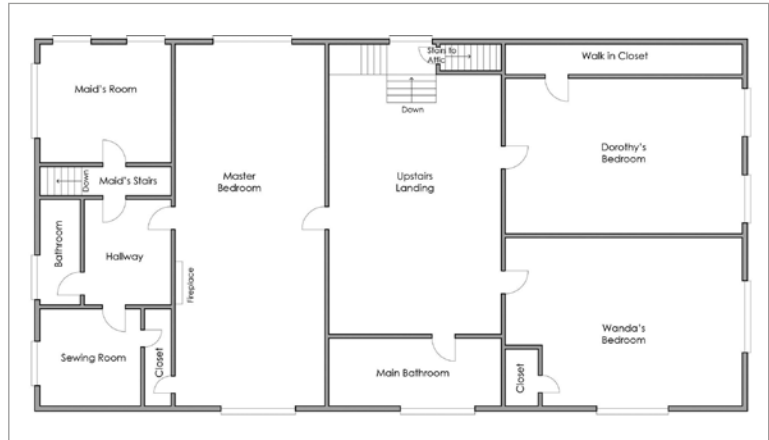
FIG. 7. FLOOR PLAN OF THE SECOND FLOOR OF THE WYATT HISTORIC HOUSE MUSEUM (NOTE: PLAN IS NOT TO SCALE). | JESSICA KIRKHAM.