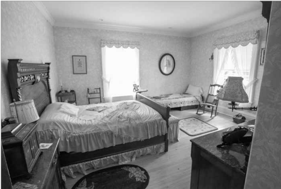
FIG. 10. WANDA WYATT'S BEDROOM UNTIL 1937. AFTER 1937—THE YEAR CECILIA WYATT PASSED AWAY—WANDA MOVED INTO THE MASTER BEDROOM OF THE HOME.