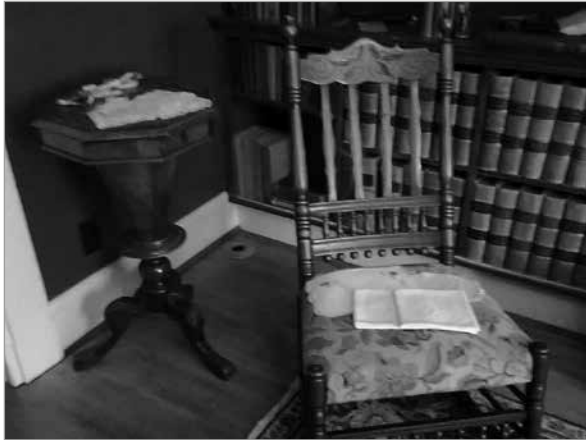
FIG. 6. ROCKING CHAIR AND SEWING TABLE IN NED'S STUDY. | ADAM KIRKEY, 2014.