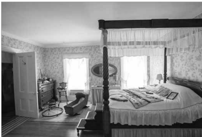
FIG. 8. DOROTHY WYATT'S BEDROOM FEATURING WALK-IN CLOSET, FOUR-POSTER BED, AND NURSERY FURNITURE. | ADAM KIRKEY, 2014.