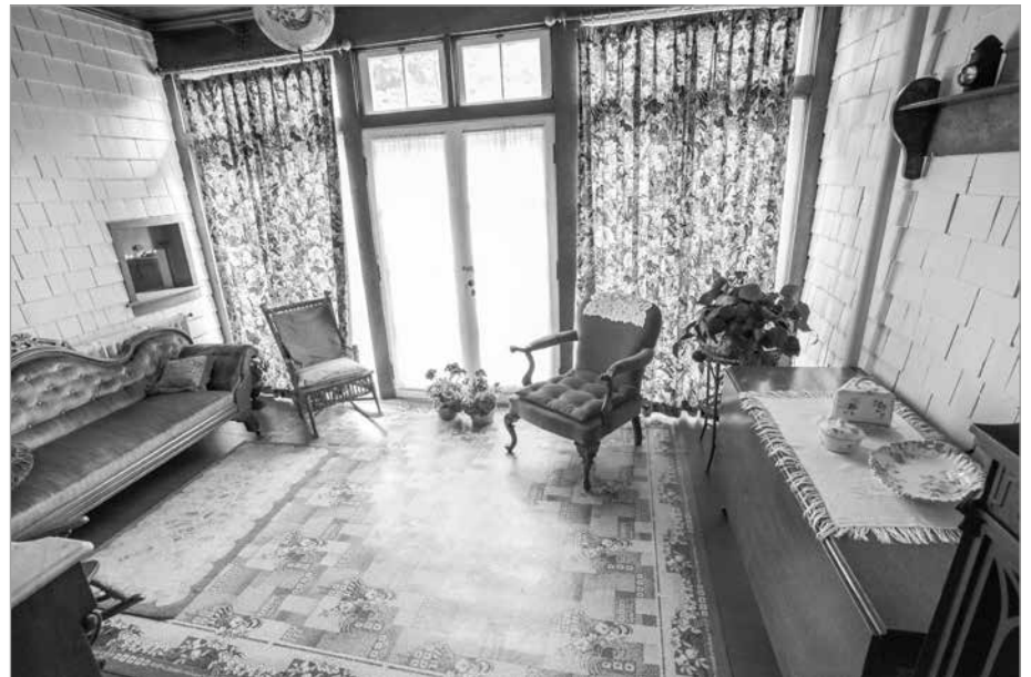
FIG. 14. THE SUN PARLOUR IN THE WYATT HISTORIC HOUSE MUSEUM.