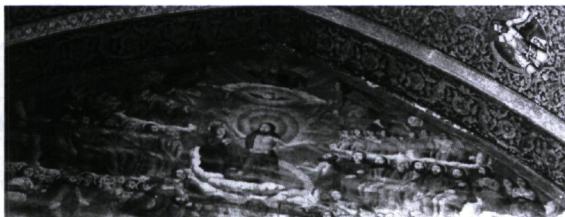
Attributed to Minas, murals in the Vank Cathedral in Isfahan, Iran, probably 1640s.