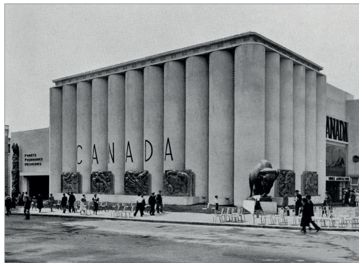
FIG. 6. CANADIAN PAVILION, 1937 WORLD'S FAIR, PARIS, FRANCE. | ÉMILE BRUNET. FROM JOURNAL, ROYAL ARCHITECTURAL INSTITUTE OF CANADA , VOL. 14, NO. 10, OCTOBER 1937, P. 203.

a comparatively few individuals seem to be given to religion, some form other than the Gothic cathedral must be found. Industry concerns the greatest numbers—it may be true, as has been said, that our factories are our substitute for religious expression. 15