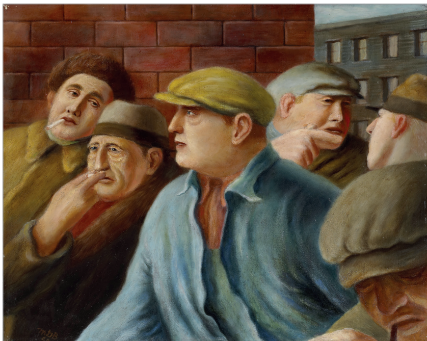
FIG. 2. MILLER BRITTAIN, LONGSHOREMEN , 1940, OIL ON MASONITE, 50.8 X 63.4 CM. | COLLECTION OF THE NATIONAL GALLERY OF CANADA, OTTAWA, PURCHASED IN 1970.

people in eastern Canada in one direction and nearby slums in the other. With cheap downtown rents and upper-floor studios, the area created an ideal setting for Saint John's artists to establish close studios, forming what was described in 1947 by Canadian Art magazine as a "distinctive artists' quarter" near the port. 8