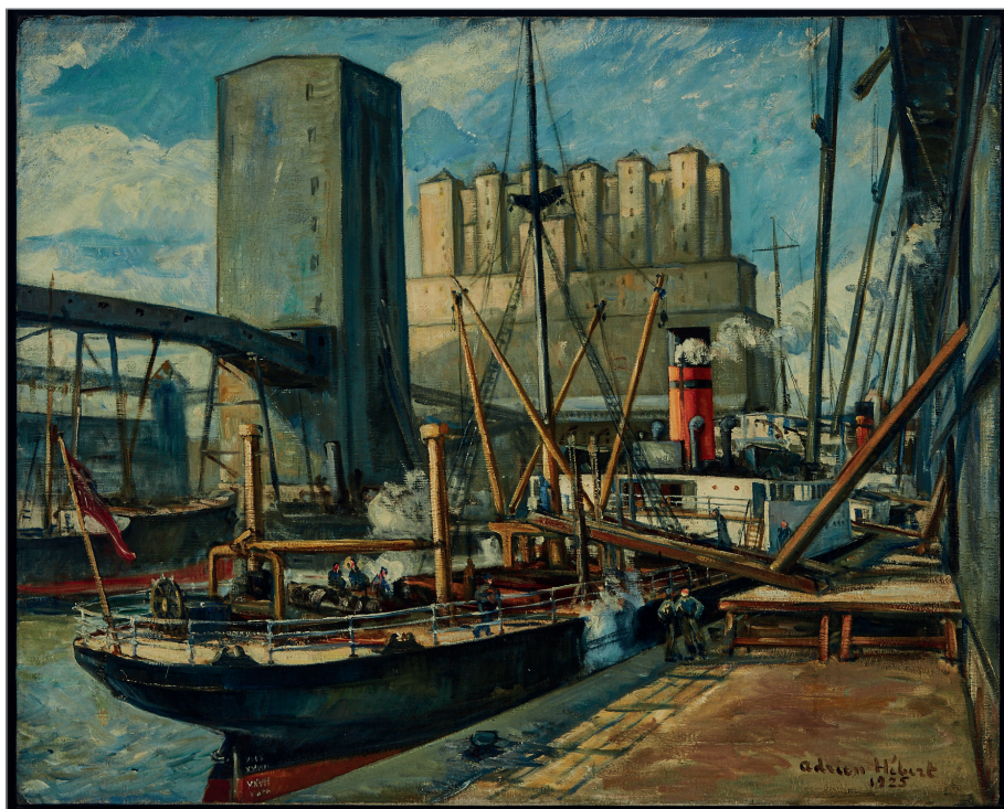
FIG. 4. ADRIEN HÉBERT, MONTREAL HARBOUR , 1925, OIL ON CANVAS, 81.3 X 101.6 CM. | PRIVATE COLLECTION.

male figure clothed in a longshoreman's coat and cap, ready for work with his lunchbox in one hand (subtly monogrammed with a MB) and a longshoreman's hook atop his other shoulder. 12 Behind the man is a middle ground filled with masses of similarly capped workers, pickup trucks going in all directions, and a billowing steam engine with a throng of boxcars. In the background are a series of ships (a tanker, tugboat, and a huge passenger liner) and a geometric concrete terminal grain elevator with its repetitive cylindrical silos.