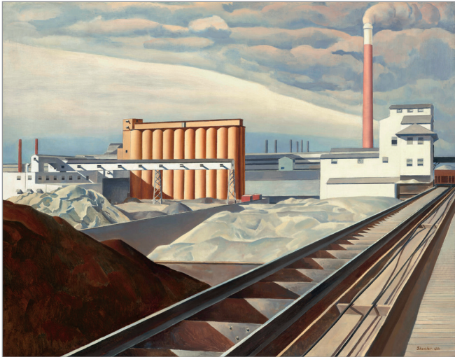
FIG. 5. CHARLES SHEELER, CLASSIC LANDSCAPE , 1931, OIL ON CANVAS, 63.5 X 81.9 CM. | BARNEY A. EBSWORTH COLLECTION, NATIONAL GALLERY OF ART, WASHINGTON, DC.