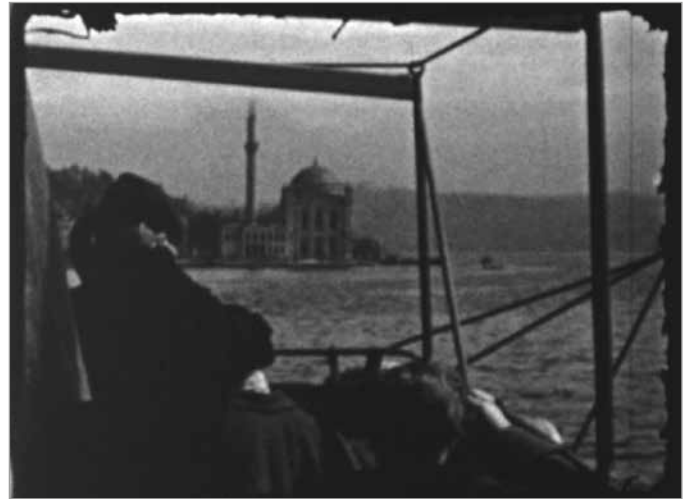
FIG. 6. FROM THE BOAT TRIP ON THE BOSPHORUS, TOWARD ORTAKÖY MOSQUE. STILL FROM HOME MOVIE.