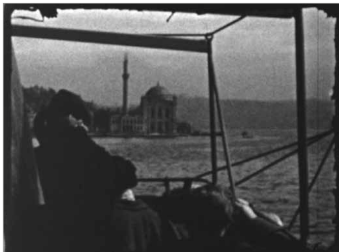
FIG. 6. FROM THE BOAT TRIP ON THE BOSPHORUS, TOWARD ORTAKÖY MOSQUE. STILL FROM HOME MOVIE.