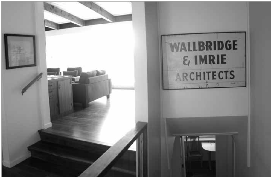
FIG. 4. THE PLATE INDICATING THE OFFICE DOWNSTAIRS. IT IS THE FIRST THING ONE SEES UPON ENTERING THE HOUSE. THE PHOTOGRAPH IS TAKEN FROM THE ENTRANCE DOOR; TO THE LEFT IS THE LIVING ROOM.

that defined the American "road trip." 40 The trip and the book that came after, On the Road , have since been viewed as characterizing a postwar American mobility to escape tradition and society in a completely masculine fashion. 41