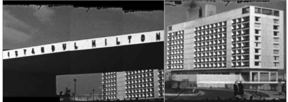
FIGS. 8 A-B. ISTANBUL HILTON HOTEL, DESIGNED BY SOM IN 1955. THE HOTEL AND THE MUNICIPALITY BUILDING ARE CONSIDERED THE FIRST TWO EXAMPLES OF INTERNATIONAL STYLE MODERN ARCHITECTURE IN TURKEY. STILLS FROM HOME MOVIE.