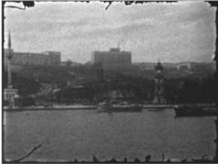
FIG. 9. HILTON HOTEL SEEN FROM THE BOAT. STILL FROM HOME MOVIE.