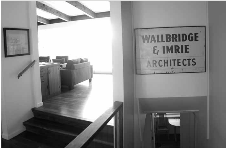
FIG. 4. THE PLATE INDICATING THE OFFICE DOWNSTAIRS. IT IS THE FIRST THING ONE SEES UPON ENTERING THE HOUSE. THE PHOTOGRAPH IS TAKEN FROM THE ENTRANCE DOOR; TO THE LEFT IS THE LIVING ROOM. | IPEK MEHMETOĞLU.

that defined the American "road trip." 40 The trip and the book that came after, On the Road , have since been viewed as characterizing a postwar American mobility to escape tradition and society in a completely masculine fashion. 41