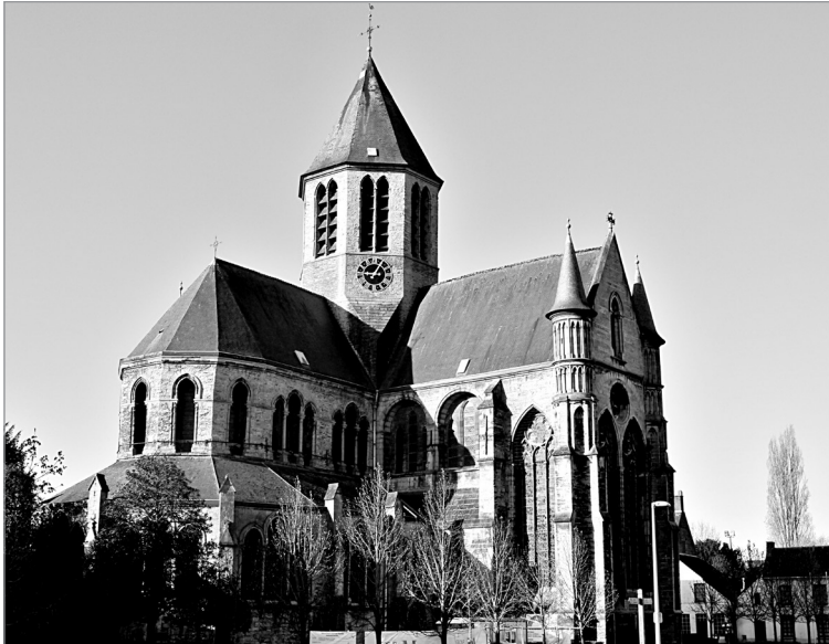
FIG. 7. VIEW OF SOUTH SIDE OF OUR LADY OF PAMELE, OUDENAARDE, BELGIUM (1234-1264).