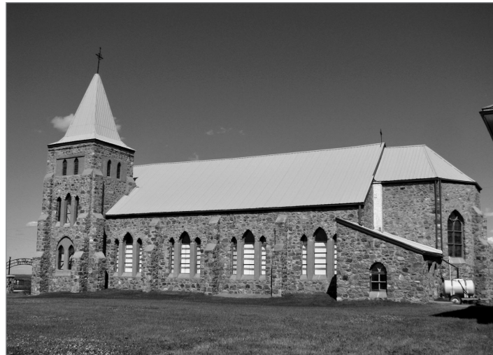
FIG. 6. VIEW OF THE SOUTH SIDE OF KAPOSVAR ROMAN CATHOLIC CHURCH, KAPOSVAR, RM 183, SK (1906-1907). UNKNOWN ARCHITECT, PIROT STONEMASONS.

narrative held within the façade showed unlimited ambition for the future of the congregation and the colony, one on par with the highest glories of their homeland.