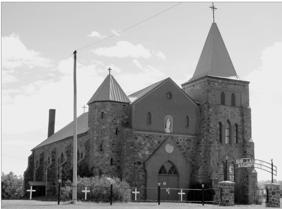
FIG. 1. VIEW OF THE NORTH SIDE OF KAPOSVAR ROMAN CATHOLIC CHURCH, KAPOSVAR, RM 183, SK (1906-1907). UNKNOWN ARCHITECT, PIROT STONEMASONS.

However, there are disadvantages to these macro-themed approaches as well. In an architect-centred approach, the tendency is to focus on the common elements of the architect’s motivations across the various structures, at the expense of the motivations of more disparate groups. While this disadvantage may not seem to be initially significant, it can be extremely important when the larger picture is considered. In the case