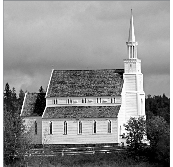
FIG. 8. VIEW OF THE SOUTH SIDE OF HOLY TRINITY ANGLICAN CHURCH, STANLEY MISSION, SK (1854-1860). UNKNOWN ARCHITECT.