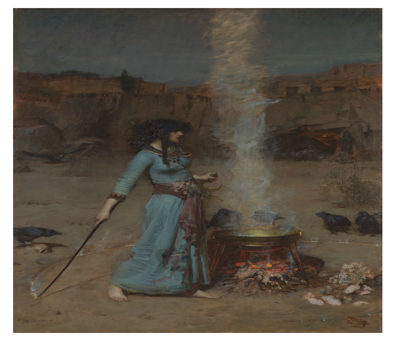
Figure 8. John William Waterhouse. The Magic Circle . 1886. Oil on canvas (Tate Britain, N01572). Presented by the Trustees of the Chantrey Bequest 1886.

Certainly that is what the magic circle represents in iconographical reiterations of ovot in art. Perhaps it is the quintessential emanation of ovot in that it is omnidirectional, synchronously retaining and expelling in perpetuity. For those within its boundaries it may offer sanctuary and confidence, outside exclusion and vulnerability. One of the great ironies in art that recalls the narrative of I Sam 28 is that the Endoran ovot , banned from the kingdom of Israel, sometimes bars Saul from entering the confines of the magical shape. Such is the case in the 1886 painting by John William Waterhouse titled The Magic Circle (figure 8).<sup>66</sup>