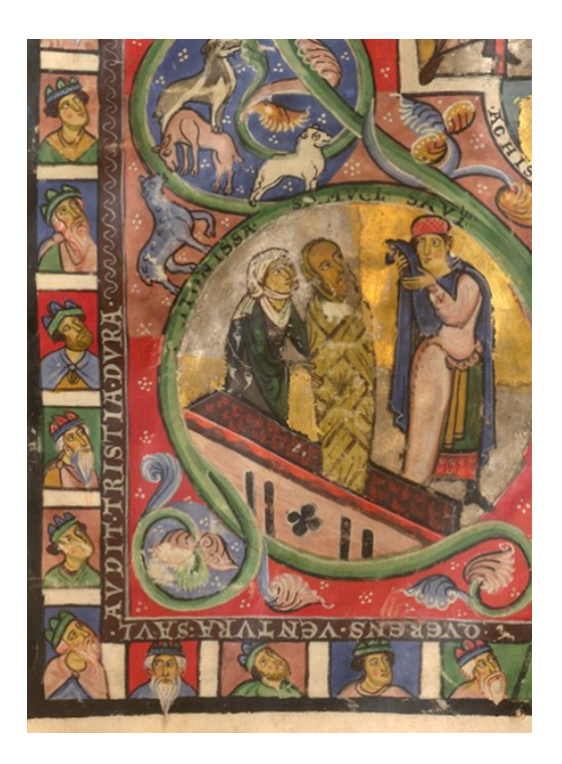
Figure 1. Bavarian School. Detail of Saul and the Witch of Endor from The Life of Saul and David . C. 1180. Illuminated manuscript (Gumbertus Bible, University Library Erlangen-Nürnberg, MS 1, fol. 82v.). Attribution non-commercial-ShareAlike 4.0 International (CC BY-NC-SA 4.0).

ψυχομαντεία ( psuchomanteia , Latinized as sciomancia ), "divination from shades" or the evocation of ghosts.<sup>12</sup>