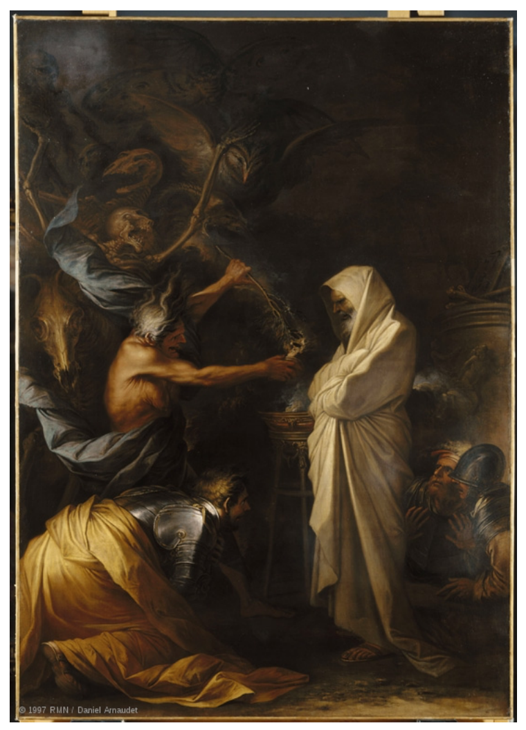
Figure 2. Salvator Rosa. The Spirit of Samuel appearing to Saul at the house of the Witch of Endor . 1668. Oil on canvas (Louvre, INV 584; MR 468). Photo © RMN-Grand Palais (Musée du Louvre)/Daniel Arnaudet /Art Resource, NY.

kingdom of Israel, the logical conclusion translators reach is that they must have presented such effrontery to Mosaic law that they could only be described as having engaged in the most infernal of practices. Beginning in the late medieval period, "the Latin necromantia [was]...used as a critical label for all illicit rituals."<sup>23</sup> In the twelfth century, John of Salisbury confuses the Greek word for death, vekpoç ( nekros ), with the Latin for black, nigreos , and conflates necromantia with nigromantia or "black magic."<sup>24</sup> It is this disordered thinking that seemingly justifies the expulsion of the ovot and yid'onim from Saul's realm, and drives a substantial number of artworks where the Endoran is presented as a diabolically frightening creature, none more so than in Salvator Rosa's enormous oil painting from 1668 (figure 2).