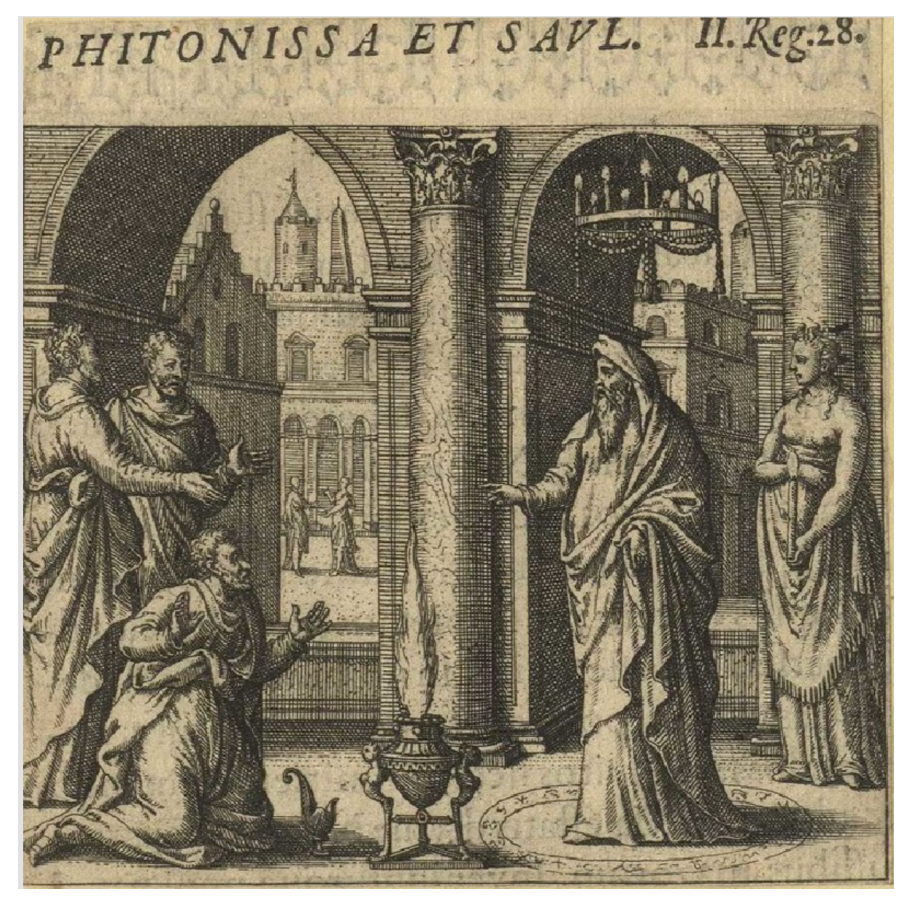
Figure 4. Theodor de Bry. Samuel Conjured by the Witch of Endor . 1596. Etching on laid paper (Ashmolean Museum, WA2003.Douce.1905).

The "Pythoness of Endor" appears as a label on the illustrations, or in the titles, of eighteen percent of artworks surveyed herein; the first produced circa 1180 (figure 3) and the last in 1902. Thus, for nearly a millennium art was produced, and reproduced, depicting the woman in I Sam 28 with an Apollonian misappellation. The Endoran was not Greek, not an acolyte of Apollo, not an oracle nor prophetess in any way. Yet because ovot became equivalent to Pythia, artists borrow more than just the anonym. They transfer Pythian accoutrements as well, such as the \tau \rho i \pi \delta \alpha ( tripoda , tripod), which first appears in a 1596 etching by Theodor de Bry (figure 4).<sup>32</sup>