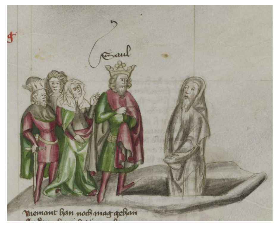
Figure 7. Bavarian School. Detail of Samuel Rises from the Grave before Saul from Weltchronik . C. 1390. Illuminated manuscript (Bpk/Staatsbibliothek zu Berlin, Preussischer Kulturbestiz, Ms. Germ. Fol. 1416, fol. 172r). Attribution non-commercial-ShareAlike 4.0 International (CC BY-NC-SA 4.0).

The same can be said of ovot when presented as a pit, or hollow, a less complex and flattened form than the cave. Cross-cultural phonetic and linguistic connections have been explored between the Hebrew ovot as "ritual pit" and terms designating a similar thing in Sumerian, Hittite, Ugaritic and Assyrian. What is most important about the ritual pit is that the space was considered a "sacred orifice," only accessible to a designated individual.<sup>56</sup> The likening of a hole in the ground to an orifice recalls those few works of art where Samuel is not just summoned upward but almost comes forth in a rebirthing as in figure 7.