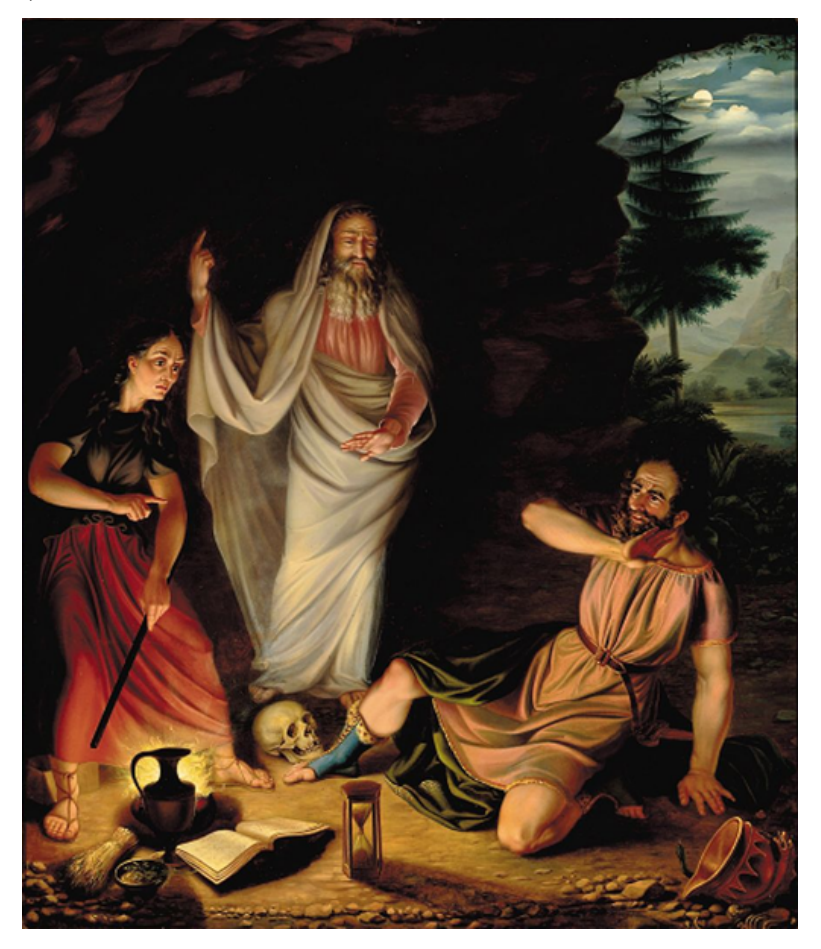
Figure 6. Attributed to Nicolaus Wolff. Saul and the Witch of Endor. 1783. Oil on canvas (Private Collection).

Caves are therefore a clear link, not only to the motherly Earth itself, but with ancestors who once worshipped within them. This further strengthens arguments like Bill Arnold's, that ovot may signify "the deified spirit of one's ancestor and, metonymically, the phenomenon of the ancestor cult."<sup>54</sup> In art, the cave functions rather similarly to a bottle, where the substance can be seen or obscured, sometimes simultaneously. Such is the case in the painting attributed to Nicolaus Wolff (figure 6), where much of the outside landscape is hidden from those within the cave, but the viewer can both gauge the terrain of the landscape in the upper right (the quasi-Alpine atmosphere represented by the lone pine tree) and time of day (night, with the full moon partially seen behind clouds).