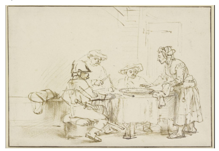
Figure 5. Rembrandt van Rijn (or Workshop). Saul and the Witch of Endor . C. 1645. Indian ink heightened with white gouache (Frankfurt am Main, Städel Museum, 13074) 11

If ovot is "skin bottle," then perhaps a cave is "earth bottle," a sort of inverse orientation of the female form. Or, as Joseph Campbell puts it: " [the Earth Goddess] is the cave itself, so that initiates who passed through the rites deep under the earth were returning to and reborn from her womb."<sup>49</sup> The Endoran woman's connection to caves as an extension of universal earth mother also serves to reinforce those maternal aspects that are notable in 28:22. Honoring the ancient custom of hospitality, sacred among many cultures and highlighted throughout the Torah, the woman acts a pious exemplar.<sup>50</sup> Her insistence that Saul eat after his initial refusal reveals a maternalism that exceeds the bonds of xenodochy. She first indulges his reluctance although his is "the response of a petulant child, too hungry to get up to eat, too distraught to be comforted."<sup>51</sup> However, a notable counterargument is offered by Moshe Garsiel, who holds that the woman acts as temptress, forcing Saul to break his fast "like Eve tempts man to eat forbidden fruit."<sup>52</sup> As a motif, it was not popular among artists exploring the topic, and forms the basis of a mere six percent of artworks, the most famous example executed by Rembrandt in the mid-seventeenth century (figure 5).<sup>53</sup>