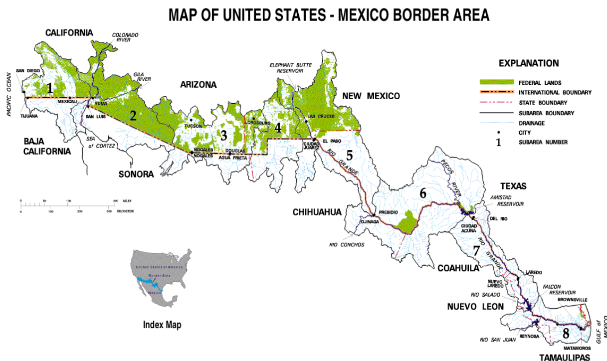
Figure 1. Hydroregionalization of the US-Mexico border region. Woodard and Durall 1996.

Working with other U.S. and Mexican agencies, the United States Geological Survey (USGS) has developed the U.S.-Mexico Border Environmental Health Initiative (BEHI) to study the interactions between human health, environmental factors, population growth, and economic development (USGS 2010). BEHI researchers have developed a geospatial database of human health and environmental variables of the borderlands region and serve these data on the Web. (Figure 2 depicts the USGS study area). BEHI research also includes interactions between contaminant levels, human health, and wildlife species in border watersheds (USGS 2010). The successful outcomes of this research reflect a long standing commitment of USGS staff to conduct collaborative research.