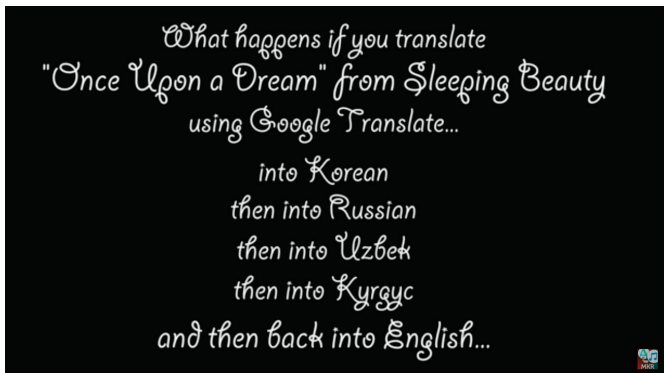
Figure 3. Google Translate Sings: Sleeping Beauty (Reese, 2016)

Reese's process is randomized to a certain extent, in that the layers through which she puts each segment might vary, both in kind and number, but the modus operandi is always the same. Urdu, Icelandic, Macedonian, Afrikaans, Nepali, Swedish, and Japanese are frequent players in Google Translate Sings' games because they form language pairings for which relatively few bitexts are available, and they share little in terms of syntactical structures or lexicon. The more linguistic discrepancy, the better, as the machine would be more prone to make mistakes, making those languages effective intermediaries, i.e., ones that can efficiently destabilize English syntactical structures. This method consistently turns recognizable lines from popular songs into artistically grotesque lyric re-imaginings.