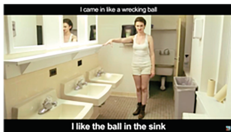
Figure 7. Google Translate Sings: “Wrecking Ball” by Miley Cyrus (PARODY) (Reese, 2014b)

The efforts that are put forth in referencing the original while at the same time enhancing the discrepancies are at the core of Google Translate Sings’ comedy. The recognizable nature of the source and its mediated target are what both appeal to