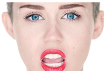
Figure 4. Miley Cyrus (2013), Wrecking Ball

out “I like the ball in the sink” (2014b) with the same emotional commitment, swinging a baseball bat and dropping a baseball in a bathroom sink (Figure 7).