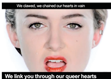
Figure 5. Google Translate Sings: “Wrecking Ball” by Miley Cyrus (PARODY) (Reese, 2014b)