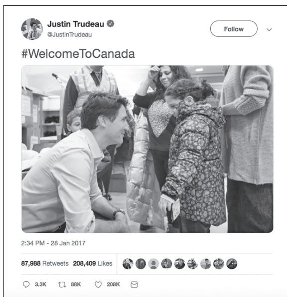
Fig. 1. Trudeau's #WelcomeToCanada tweet on January 28, 2017.

If 9/11 prompted a "renewal" of white nationalism in Canadian national identity, as Sedef Arat-Koc argues, #WelcomeToCanada seemingly marks a shift away from this form of nationalism and toward the multicultural inclusion of Muslims and other racialized subjects. Arat-Koc contends that the reconfigured post-9/11 Canadian identity made apparent the tensions "inherent in liberal Canadian multiculturalism from its inception [...] It therefore involved a confirmation, crystallization, and rigidification of the preexisting implicit boundaries of a white national identity and belonging" (33). I suggest that the #WelcomeToCanada campaign's apparent move away from the white nationalism associated with Trump's America actually racializes and genders "safe" intimacy and cross-cultural contact as white and heteropatriarchal. While the Trudeau government in fact implemented