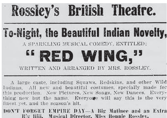
Fig. 3. Red Wing advertisement from the Evening Telegram , 22 May 1917.

The Rossleys, with their use of blackface and other racist performance practices, demonstrate the complex way that Atlantic culture has influenced racial knowledge in Newfoundland. 15 Examining this past helps us understand twentieth century constructions of blackness in Newfoundland's settler population while highlighting the transnational connections that inform the practice of blackface minstrelsy and constructions of race in St. John's.