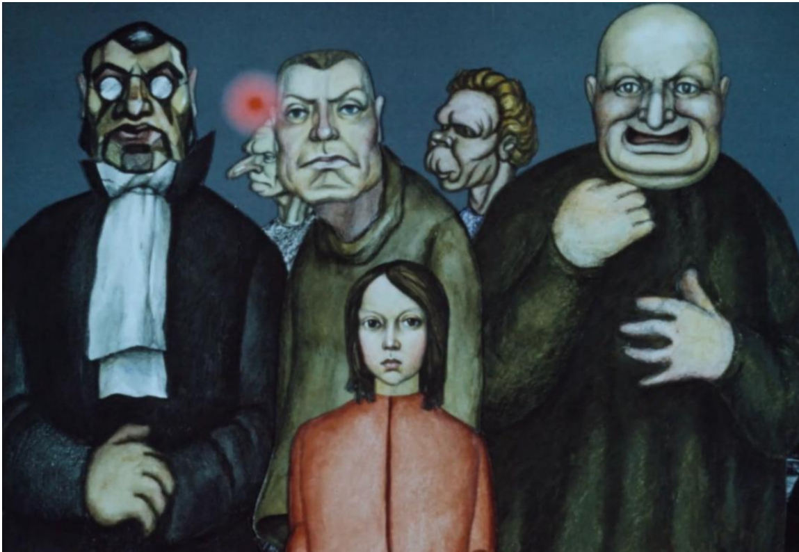
Figure 1. A frame from Andrei Khrzhanovsky's Glass Harmonica (00:02:44)

oppressive atmosphere is a device used consistently in the film, promoting the idea of not following the mainstream rule, the static behaviour of the crowd. The protagonist goes on to interrupt immobility with a gesture: he picks up the flower, demonstrating an intention to continue the artistic mission. The protagonist reappears later as a grown-up carrying a glass harmonica, the sound of which starts to transform ugliness into beauty.