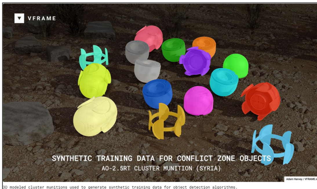
Figure 2: VFRAME project's synthetic training data for conflict zone objects

As a counterexample to the potential for synthetic training data to intensify the disappearance of disappearance, the VFRAME project (Harvey 2019) showcases how they can also be mobilized to emancipatory ends. Concretely, the project has been devoted to developing synthetic training data for object recognition systems capable of identifying the use of illegal cluster munitions in active war zones, such as Syria and Russia (Murgia 2021). The reason for the indispensability of synthetic data here is that “videos containing cluster munitions are typically limited in quantity” and are captured in “extreme situations” that substantially degrade their quality as training data (Harvey 2019). Moreover, they offer substantial safety improvements over the crowdsourcing of photos of live munitions. One of the project's broader aims is to support human rights investigators and to work towards achieving accountability.