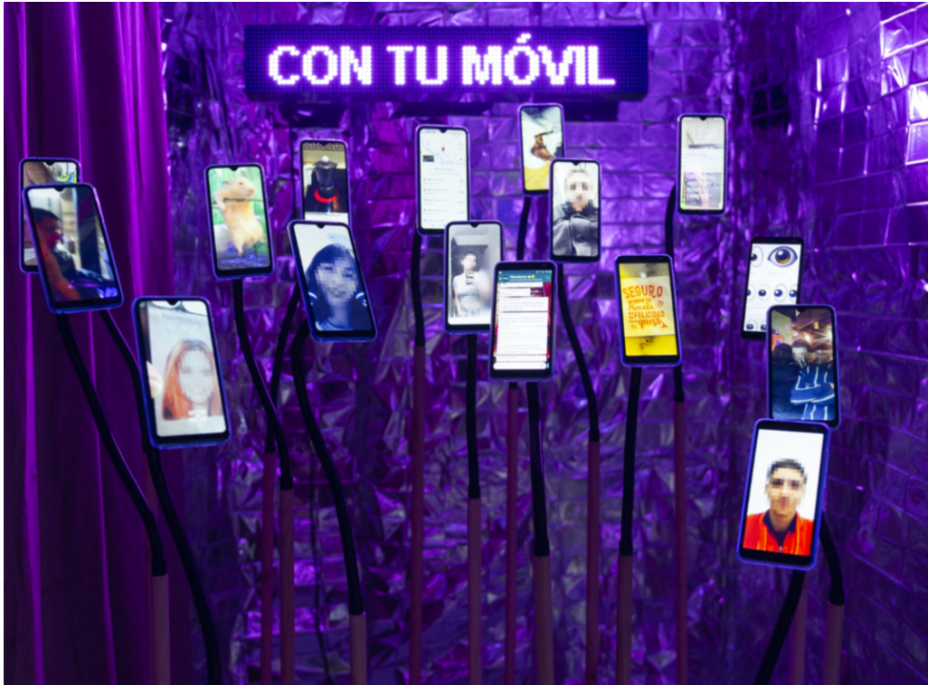
Figure 1: "Stalk me to the end of love" installation. PC6-2019. Bilbao's Experimental Arts International Festival – MEM.