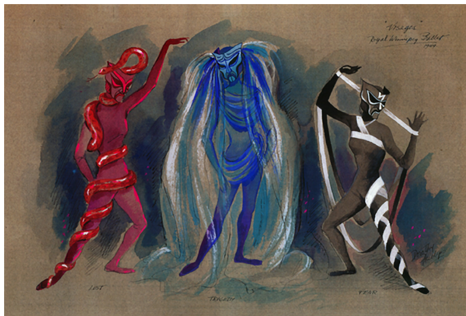
Figure 2: Sketch by Dorothy Phillips for Visages .

eleven-minute film was shot under the direction of Roger Blais. The excerpt from Visages is the longest of any single ballet on this film. It is 2 minutes and 19 seconds long (Blais 1949, 3:42 to 6:01). 8