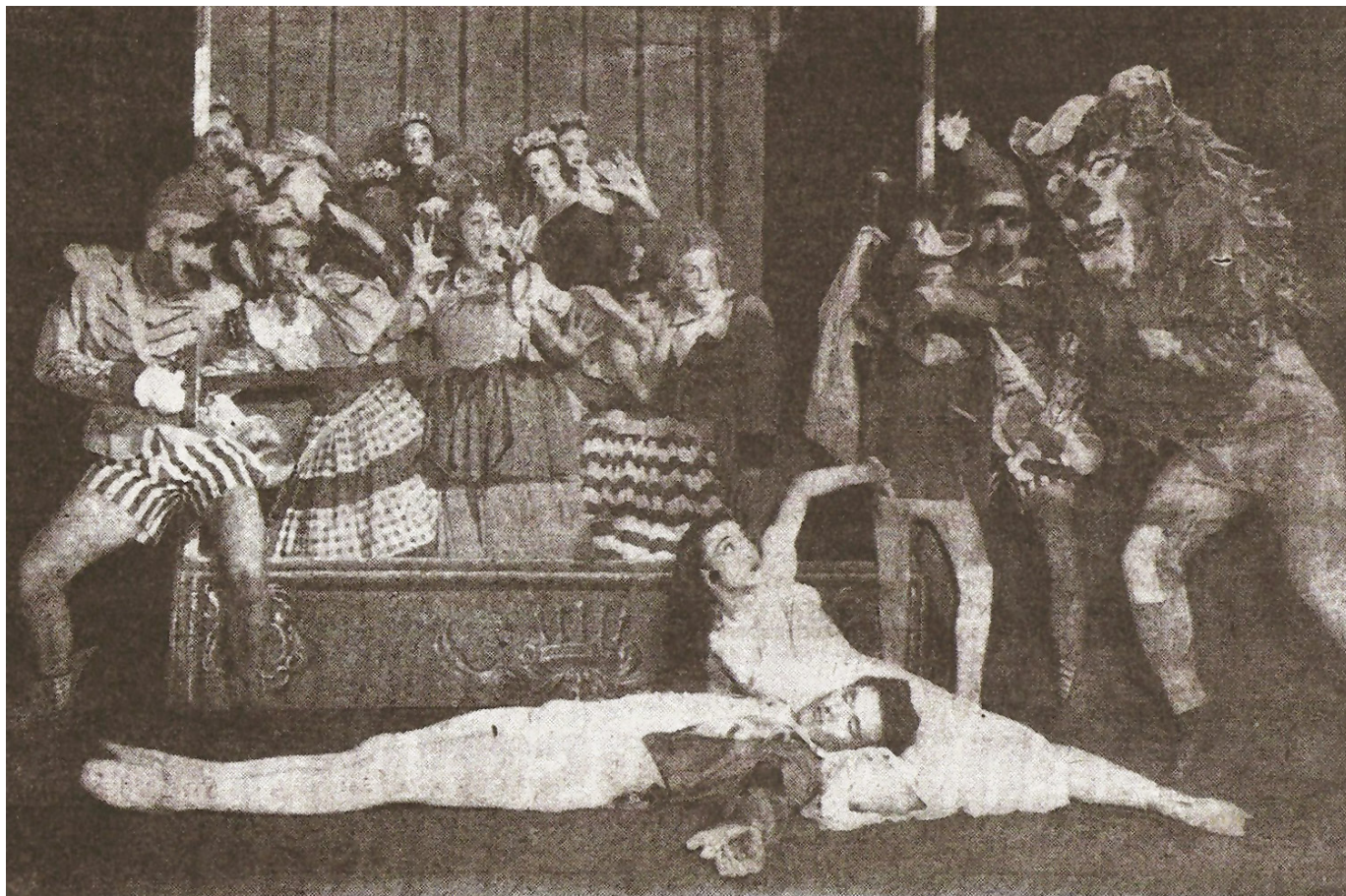
Figure 4: Still from Act 3 of The Rose and the Ring (“Ballet Fantasy” 1949, 13).

His theme for Princess Betsinda is nostalgic in character in which the strings achieve beautifully rich harmonic effects at various intervals during action in which she is chief participant—notably the pas de deux with Prince Giglio.