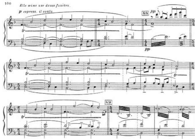
Example 4 Maurice Emmanuel, Salamine (1929), Act II, sc. 1 (VS 100).

expression seen in the placement of one hand on the head and the other directed toward the dead body. In Emmanuel's Figure 543 one can see the earlier depictions of the ritual, which were later replaced by the stylized gesture in Figures 551 and 553 (See Figs. 1a and 1b). Emmanuel described these latter poses as "prototypical" funeral gestures, and stated that although the ritual of tearing the hair had been lost, the gesture had been retained; moreover, Emmanuel described the dance for these funeral rites as "full of calm" versus the violence of the threnodic hair pulling. 10