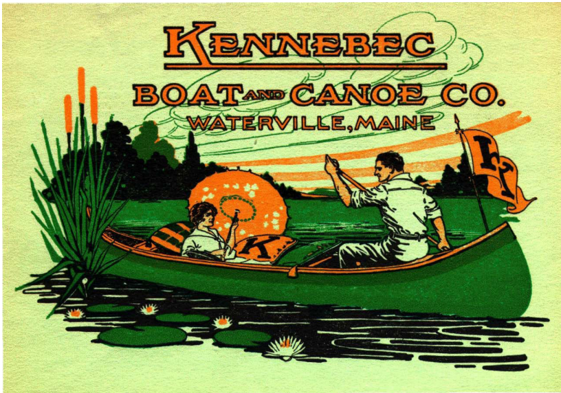
Figure 2. Cover for the Kennebec Boat and Canoe Company Catalog (1918). A typical canoedding tableau, the cover shows a female reclining in the bow on pillows, shading herself with a parasol as she gazes at the man paddling at the stern, in control of the canoe.

as the 1880s, “canoedding” — the canoe-based variant of “canoodling” — was becoming a tableau in popular culture. 12 The image of a man paddling at the stern as he woos a woman reclining on cushions in the bow recurred in magazines, calendars, advertisements, and postcards (see Fig. 2).