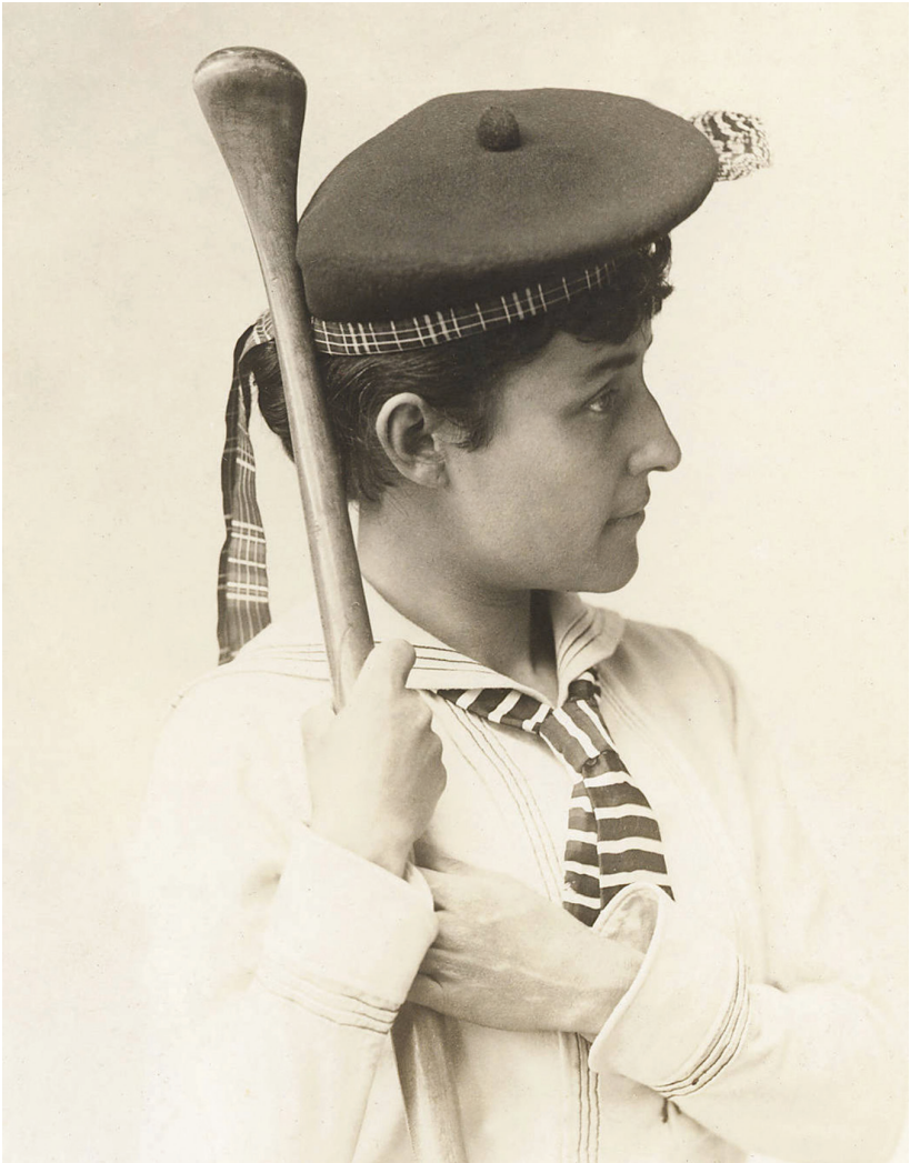
Figure 1. Johnson outfitted for canoeing with paddle and tam o' shanter cap.

canoe is apt, however, because in her canoe — literally or in her writing — Johnson proved adept at controlling her identity.