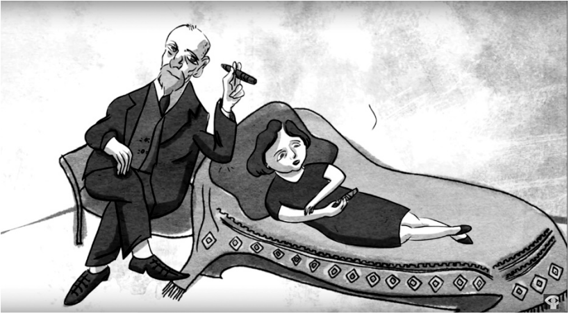
Figure 2: From I Was a Child of Holocaust Survivors (dir. Anne Marie Fleming, National Film Board, 2010); reprinted with permission of Bernice Eisenstein.